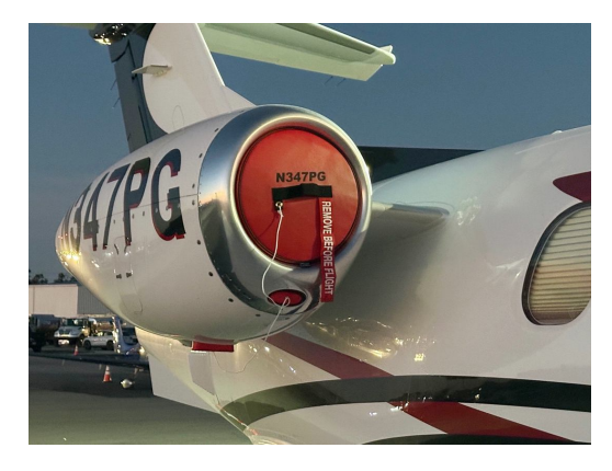
Embraer Phenom 100 Intake & Exhaust Plugs