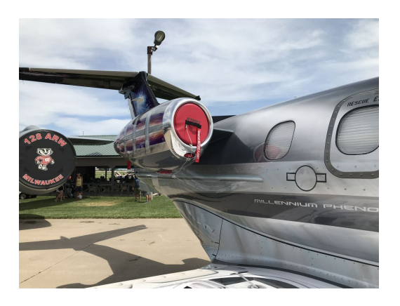
Embraer Phenom I Engine Inlet Plugs

The Engine Inlet Plugs are custom fit for your Embraer Phenom 100 (EMB-500) intakes, made with heavy-duty vinyl material, and stuffed with a single block of sculpted urethane foam. Each plug has a zipper that allows the foam to be removed and dried if necessary. Engine plugs have 'remove before flight' streamers sewn onto the face of the plugs. Most plugs are imprinted with the aircraft registration number in black for an extra charge. Storage bag NOT included. Engine plugs may be inserted after flight when the engine is still warm. Engine Inlet Plugs are commonly referred to as Cowl Plugs, Intake Plugs, Cowl Blocks, Engine Blocks, and Engine Bungs.