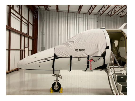
Embraer Phenom 100 Cockpit Cover

This cover type is made from Silver Acrylic Sunbrella canvas and is 100% lined with a soft and smooth microfiber. Bruce's Custom Covers developed this material combination especially for aircraft protection. The outer material is medium weight and treated for water resistance, UV resistance and anti-static buildup. The inner lining is a very soft and smooth microfiber to prevent scratching. The material is very reflective, and tests show that the cabin interior temperature can be reduced to near-ambient temperature on the hottest of days. It is water, ice and snow repellent, yet breathable to allow moisture to escape from between the cover and the aircraft surface.