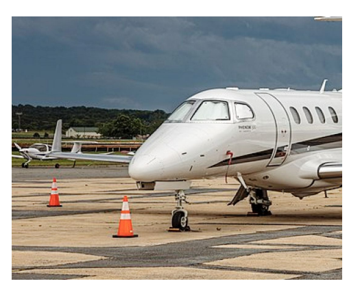
Embraer Phenom 100 Cockpit HeatShields

out because some aircraft manufacturers have issued advisories against reflective window inserts due to potential heat damage. A Heatshield is an excellent short-term remedy for cockpit overheating, but an external fabric cover is more effective for long-term protection.