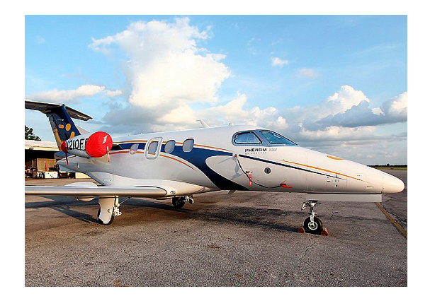
Embraer Phenom 100 Engine Covers set, Heat Resistant Pitot and AOA Covers & Interior Cockpit HeatShields set