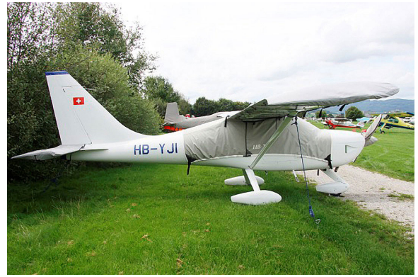
Glastar Canopy, Wings, Horizontal Stab. & Prop Covers