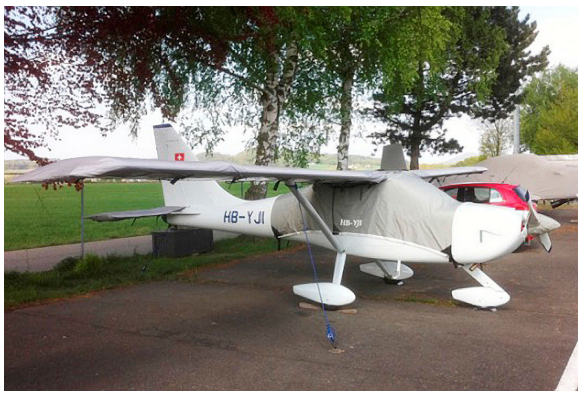
OMF Symphony Canopy, Wings, Horiz. Stab, and Prop Covers