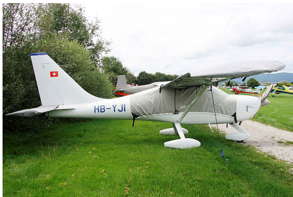
Glastar Canopy, Wings, Horizontal Stab. & Prop Covers

WINTER USE MATERIAL - Made with Solution-Dyed Polyester fabric, this option is intended for seasonal use to aid in deicing, rain mitigation, or for occasional travel. The material is lighter and more compact, but more susceptible to UV damage and may have a shorter useful life if used continuously outside than the all-year use material.