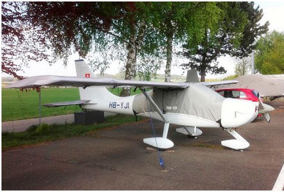
OMF Symphony Canopy, Wings, Horiz. Stab, and Prop Covers