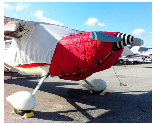
Glstar Insulated Engine Cover