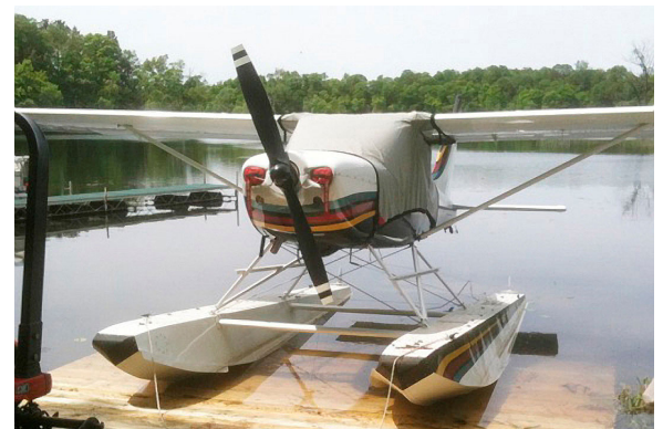
Glstar Sportsman Canopy Cover and Engine Plugs