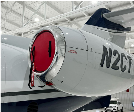
Pilatus PC-24 Engine Inlet Plugs