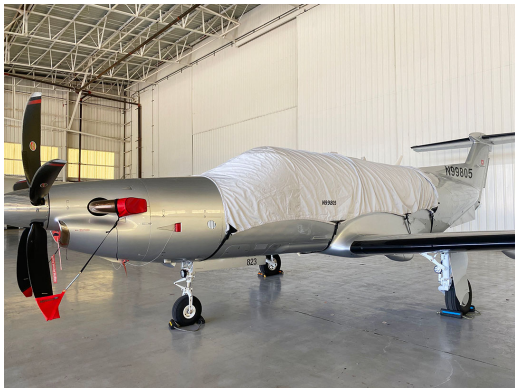
Pilatus PC-12, U-28A, NGX Cockpit Cover, Snap-On Type

This cover type is made from Silver Acrylic Sunbrella canvas and is 100% lined with a soft and smooth microfiber. Bruce's Custom Covers developed this material combination especially for aircraft protection. The outer material is medium weight and treated for water resistance, UV resistance and anti-static buildup. The inner lining is a very soft and smooth microfiber to prevent scratching. The material is very reflective, and tests show that the cabin interior temperature can be reduced to near-ambient temperature on the hottest of days. It is water, ice and snow repellent, yet breathable to allow moisture to escape from between the cover and the aircraft surface.