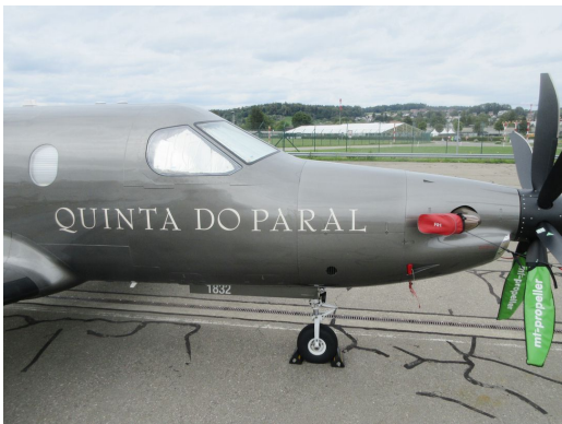
Pilatus PC-12 Cockpit HeatShields