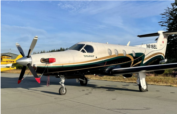
Pilatus PC-12 Prop Tie/Exhaust Covers

This cover type is made from Silver Acrylic Sunbrella canvas and is 100% lined with a soft and smooth microfiber. Bruce's Custom Covers developed this material combination especially for aircraft protection. The outer material is medium weight and treated for water resistance, UV resistance and anti-static buildup. The inner lining is a very soft and smooth microfiber to prevent scratching. The material is very reflective, and tests show that the cabin interior temperature can be reduced to near-ambient temperature on the hottest of days. It is water, ice and snow repellent, yet breathable to allow moisture to escape from between the cover and the aircraft surface.