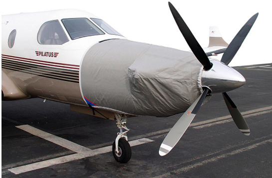
Pilatus PC-12 Engine Cover