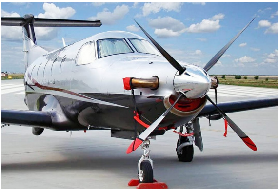
Pilatus PC-12 Engine Plugs, Prop Ties, Cockpit HeatShields

Cockpit Heatshields are interior sunshades for the aircraft's cockpit. The product is a unique composite of closed-cell foam with a silver mylar finish. The semi-rigid design is stiff enough to stand inside the window framing. The set folds up flat and is easily stored in the included storage sleeve. Some designs may require velcro and suction cups. A Heatshield is an excellent short-term remedy for cockpit overheating, but an external fabric cover is more effective for long-term protection.