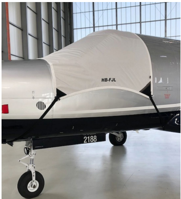
Pilatus PC-12 Cockpit Cover