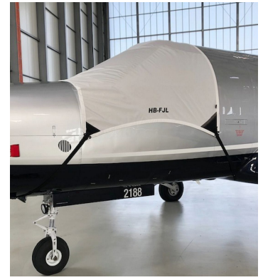
Pilatus PC-12 Cockpit Cover