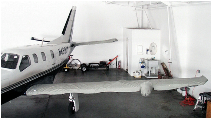
Pilatus PC-12 Wing Covers