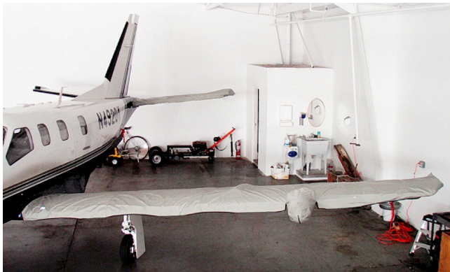
Socata TBM 700, 850 Wing and Horizontal Stabilizer Covers

WINTER USE MATERIAL - Made with Solution-Dyed Polyester fabric, this option is intended for seasonal use to aid in deicing, rain mitigation, or for occasional travel. The material is lighter and more compact, but more susceptible to UV damage and may have a shorter useful life if used continuously outside than the all-year use material.