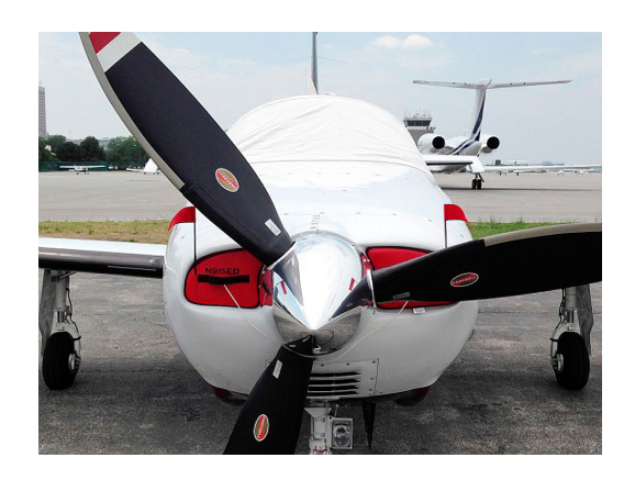
Piper Mirage Engine Plugs