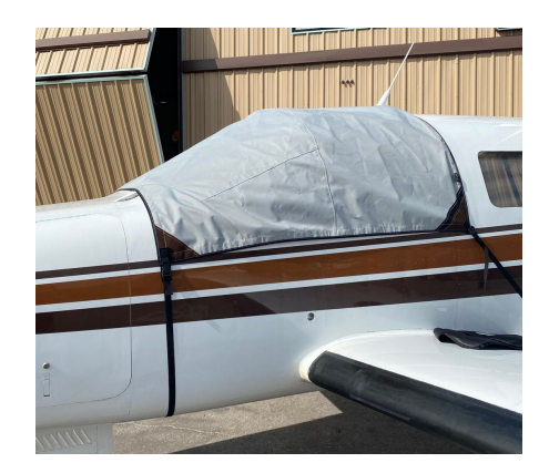
Piper PA46-310P Travel Weight Cockpit Cover

This cover type is made from Silver Acrylic Sunbrella canvas and is 100% lined with a soft and smooth microfiber. Bruce's Custom Covers developed this material combination especially for aircraft protection. The outer material is medium weight and treated for water resistance, UV resistance and anti-static buildup. The inner lining is a very soft and smooth microfiber to prevent scratching. The material is very reflective, and tests show that the cabin interior temperature can be reduced to near-ambient temperature on the hottest of days. It is water, ice and snow repellent, yet breathable to allow moisture to escape from between the cover and the aircraft surface.