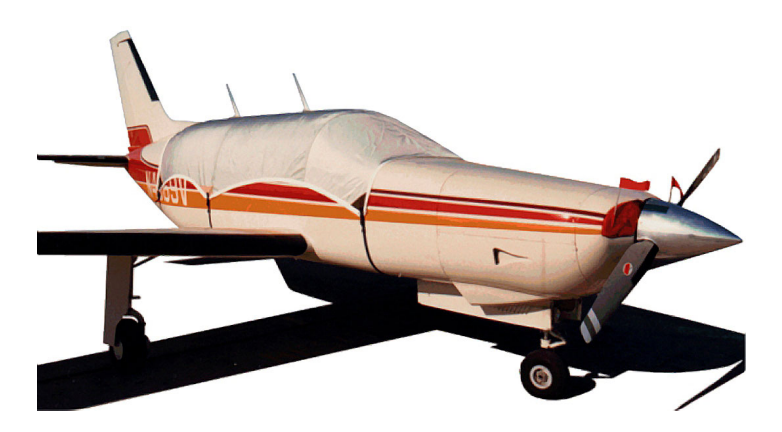
Piper Malibu/Mirage Standard Canopy Cover