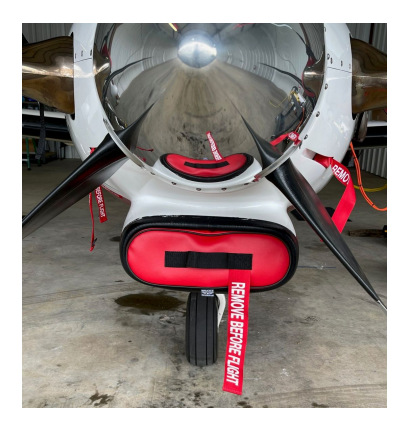
Piper Malibu JetProp Inlet Plugs

This cover type is made from Silver Acrylic Sunbrella canvas and is 100% lined with a soft and smooth microfiber. Bruce's Custom Covers developed this material combination especially for aircraft protection. The outer material is medium weight and treated for water resistance, UV resistance and anti-static buildup. The inner lining is a very soft and smooth microfiber to prevent scratching. The material is very reflective, and tests show that the cabin interior temperature can be reduced to near-ambient temperature on the hottest of days. It is water, ice and snow repellent, yet breathable to allow moisture to escape from between the cover and the aircraft surface.