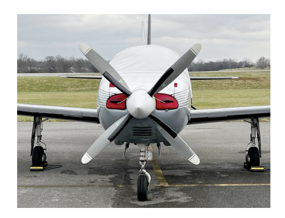
Piper PA46-350P Engine Inlet Plugs