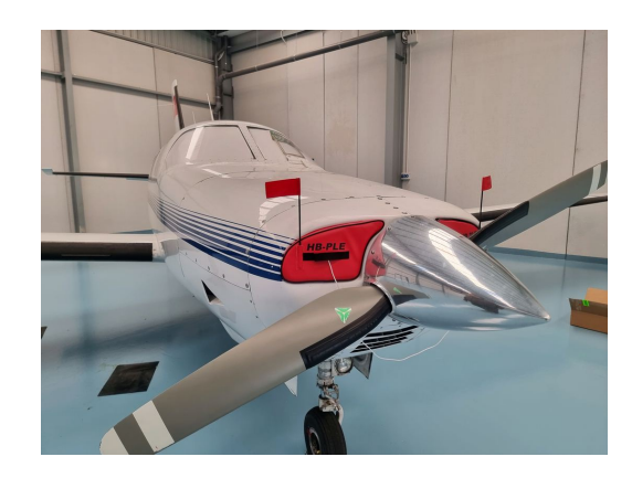
Piper PA-46 Malibu Engine Inlet Plugs

Engine Inlet Plugs are custom fit for your Piper PA-46 Malibu intakes, made with heavy-duty vinyl material, and stuffed with a single block of sculpted urethane foam. Each plug has a zipper that allows the foam to be removed and dried if necessary. Engine plugs have warning flags that are visible from the cockpit or 'remove before flight' streamers sewn onto the face of the plugs. Most plugs are imprinted with the aircraft registration number in black for an extra charge. Storage bag NOT included. Engine plugs may be inserted after flight when the engine is still warm. Engine Inlet Plugs are commonly referred to as Cowl Plugs, Intake Plugs, Cowl Blocks, Engine Blocks, and Engine Bungs.