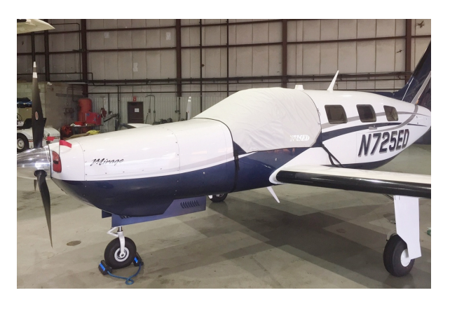
Piper Malibu/Mirage Cockpit Cover, Engine Plugs