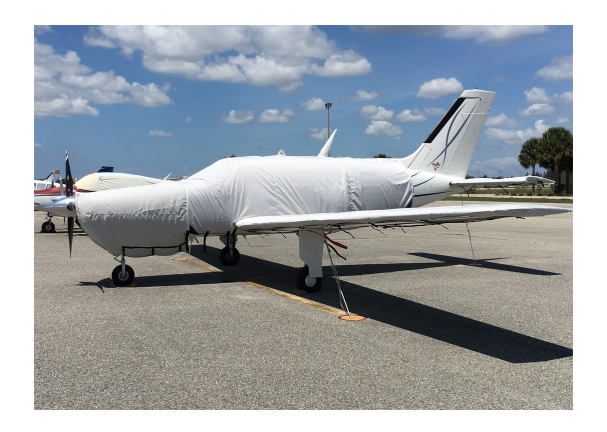
Piper Malibu Extended Canopy Cover, Engine, Wing & Horiz. Stab. Covers