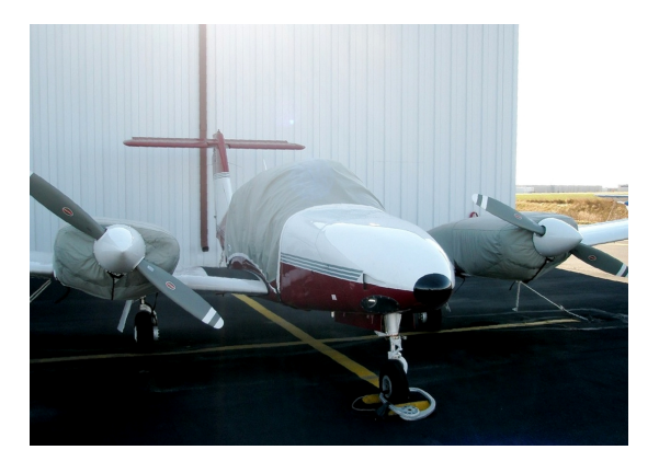
Piper Seminole Canopy and Engine Covers