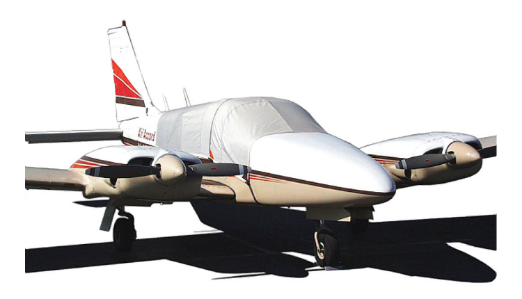
Piper Seneca PA-34 Canopy Cover

Travel Covers are made with Silver Solution-Dyed Polyester fabric and only lined over the windshield to save weight. The material is lightweight and more compact for easy stowage in the aircraft. The polyester material is water resistant, but only intended for occasional use outside. We also have an ultra lightweight material available for fitted hangar dust covers. For daily outdoor use, the non-travel Sunbrella Cover is the best choice.