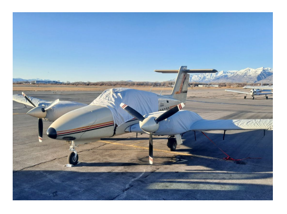
Piper PA-44 Wing/Engine Covers, Canopy Cover