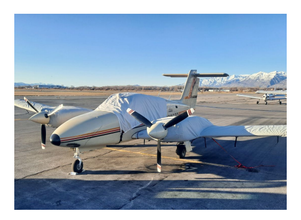
Piper PA-44 Wing/Engine Covers, Canopy Cover

WINTER USE MATERIAL - Made with Solution-Dyed Polyester fabric, this option is intended for seasonal use to aid in deicing, rain mitigation, or for occasional travel. The material is lighter and more compact, but more susceptible to UV damage and may have a shorter useful life if used continuously outside than the all-year use material.