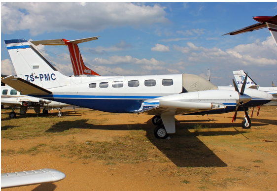
Cessna 441 Conquest II Cockpit Cover