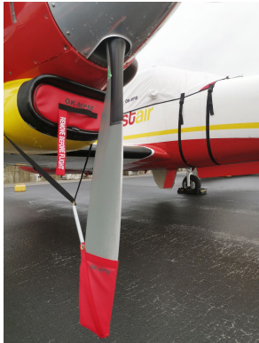
Piper PA-42 Cheyenne III Prop Tie/Exhaust Cover, Inlet Plugs