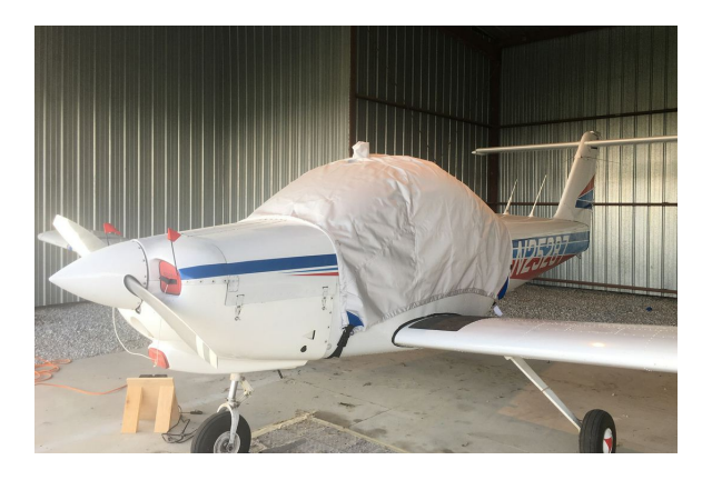
Piper PA-38 Canopy Cover