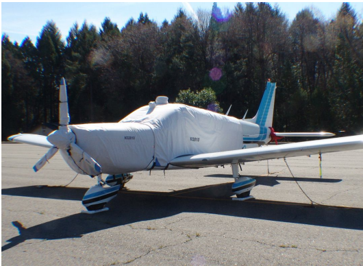
Piper PA-32R-301T Extended Canopy, Engine, Horiz. Stabilizer Covers Piper PA-32-300 Extended Canopy, Engine, Prop & Tailcone Covers