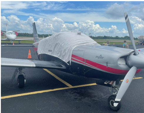
Piper PA-32R-300 Canopy Cover