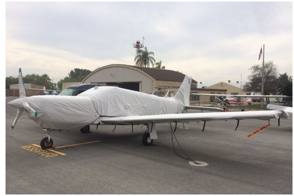
Piper Saratoga Cover Set