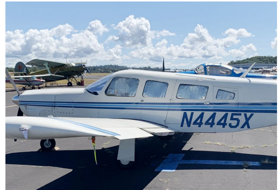
Piper PA32-300 HeatShield Set