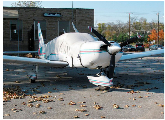
Piper PA-32-300 Canopy Cover w/baggage area extension