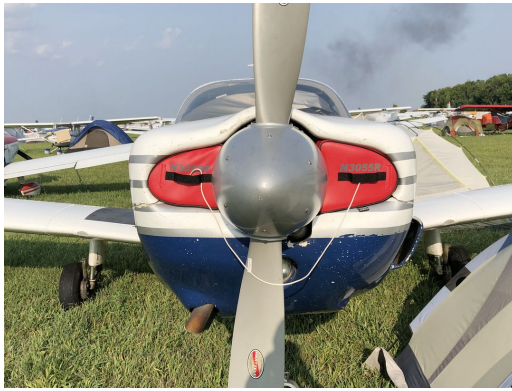
Piper PA-32 Engine Plugs