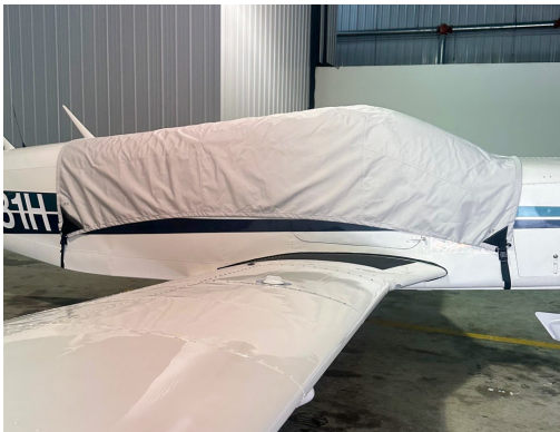
Piper PA-32 Saratoga, Cherokee 6, Lance Canopy Cover

This cover type is made from Silver Acrylic Sunbrella canvas and is 100% lined with a soft and smooth microfiber. Bruce's Custom Covers developed this material combination especially for aircraft protection. The outer material is medium weight and treated for water resistance, UV resistance and anti-static buildup. The inner lining is a very soft and smooth microfiber to prevent scratching. The material is very reflective, and tests show that the cabin interior temperature can be reduced to near-ambient temperature on the hottest of days. It is water, ice and snow repellent, yet breathable to allow moisture to escape from between the cover and the aircraft surface.