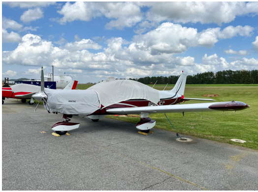
Piper PA-32-300 Engine Cover