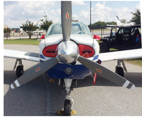
Piper PA-32 Engine Inlet Plugs