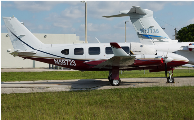
Piper Navajo Canopy, Extended Cockpit, Cockpit & Engine Covers