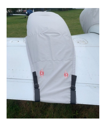
Piper Twin Comanche Engine Cover