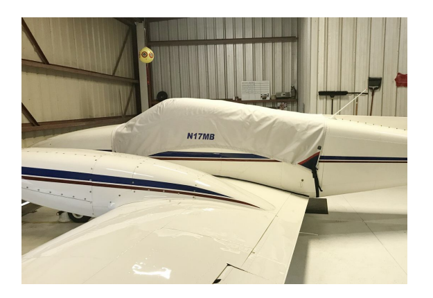
Piper PA-30 Twin Comanche Canopy Cover