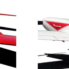
Piper Twin Comanche Canopy Cover