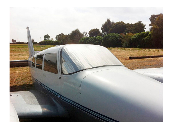
Piper Comanche Windshield HeatShield