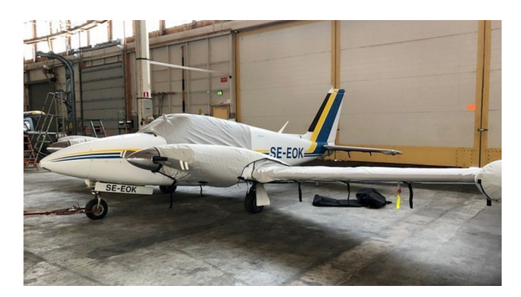
Piper Twin Comanche Wing & Insulated Engine Covers