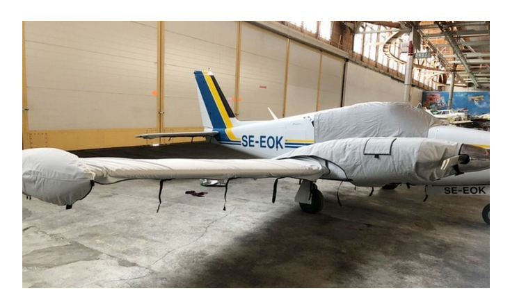
Piper Twin Comanche Wing & Insulated Engine Covers

WINTER USE MATERIAL - Made with Solution-Dyed Polyester fabric, this option is intended for seasonal use to aid in deicing, rain mitigation, or for occasional travel. The material is lighter and more compact, but more susceptible to UV damage and may have a shorter useful life if used continuously outside than the all-year use material.