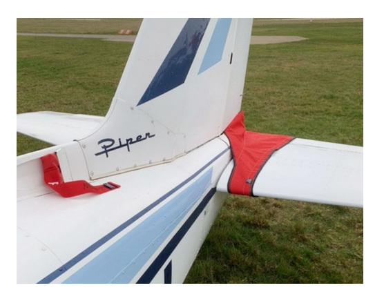
Piper Twin Comanche Tailcone Cover, Dorsal Plug