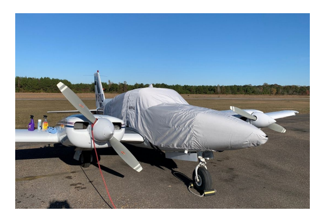
Piper Twin Comanche Extended Canopy/Nose Cover, Miller Nose