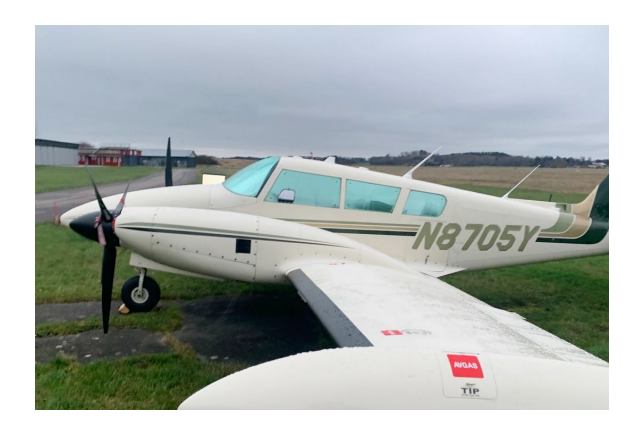
Piper PA-30 Twin Comanche HeatShields