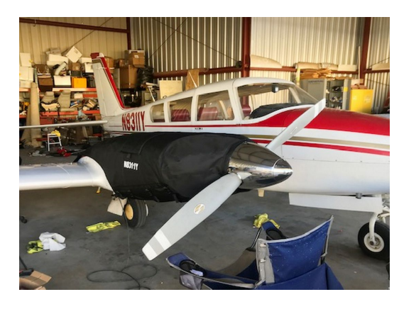
Piper PA-30 Twin Comanche Insulated Engine Cover