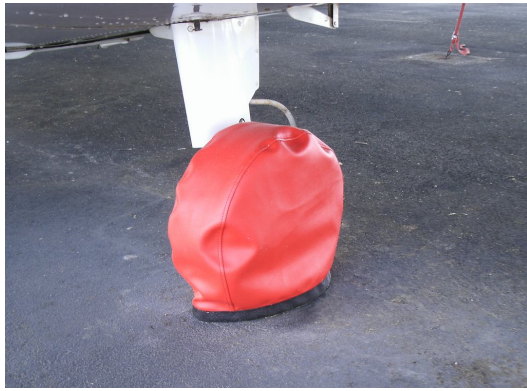
Piper PA28-140 Tire Covers