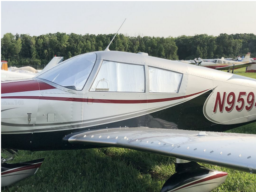
Piper PA-28-140 HeatShield Set