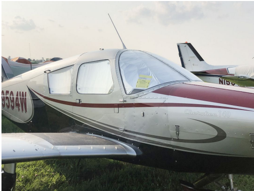
Piper PA-28-140 HeatShield Set

Windshield Heatshields are interior sunshades for an aircraft's front windshield. The product is a unique composite of closed-cell foam with a silver mylar finish. The semi-rigid design is stiff enough to stand along the inside of the windshield using sun visors or window framing. It folds up flat and easily stores in the included storage sleeve. Some designs may require velcro and suction cups or split right and left sides. A Heatshield is an excellent short-term remedy for cockpit overheating. An external fabric cover is far more effective and practical for long-term protection.