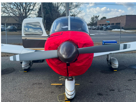
Piper PA-28-180 Insulated Engine Cover, fully enclosed

This cover type is made from Silver Acrylic Sunbrella canvas and is 100% lined with a soft and smooth microfiber. Bruce's Custom Covers developed this material combination especially for aircraft protection. The outer material is medium weight and treated for water resistance, UV resistance and anti-static buildup. The inner lining is a very soft and smooth microfiber to prevent scratching. The material is very reflective, and tests show that the cabin interior temperature can be reduced to near-ambient temperature on the hottest of days. It is water, ice and snow repellent, yet breathable to allow moisture to escape from between the cover and the aircraft surface.