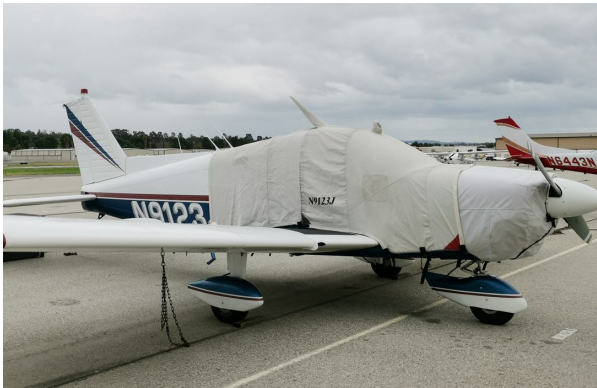
Piper PA-28 Extended Canopy Cover, Engine Cover

This cover type is made from Silver Acrylic Sunbrella canvas and is 100% lined with a soft and smooth microfiber. Bruce's Custom Covers developed this material combination especially for aircraft protection. The outer material is medium weight and treated for water resistance, UV resistance and anti-static buildup. The inner lining is a very soft and smooth microfiber to prevent scratching. The material is very reflective, and tests show that the cabin interior temperature can be reduced to near-ambient temperature on the hottest of days. It is water, ice and snow repellent, yet breathable to allow moisture to escape from between the cover and the aircraft surface.