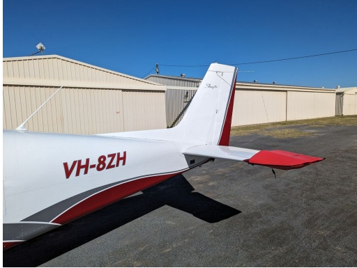
Sling TSI Horizontal Stabilizer Tip Pads

Designed to prevent damage to the aircraft extremities in crowded hangars, these products are made of bright red Naugahyde and thickly padded with a sandwich of closed cell foam.