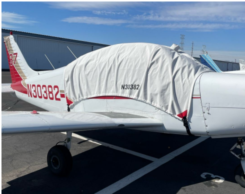
Piper PA-28 Canopy Cover, Belly Strap Type