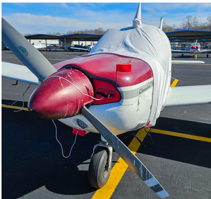
Piper PA-28-180 Engine Inlet Plugs (set of 2)

Engine Inlet Plugs are custom fit for your Piper PA-28 Models intakes, made with heavy-duty vinyl material, and stuffed with a single block of sculpted urethane foam. Each plug has a zipper that allows the foam to be removed and dried if necessary. Engine plugs have warning flags that are visible from the cockpit or 'remove before flight' streamers sewn onto the face of the plugs. Most plugs are imprinted with the aircraft registration number in black for an extra charge. Storage bag NOT included. Engine plugs may be inserted after flight when the engine is still warm. Engine Inlet Plugs are commonly referred to as Cowl Plugs, Intake Plugs, Cowl Blocks, Engine Blocks, and Engine Bungs.