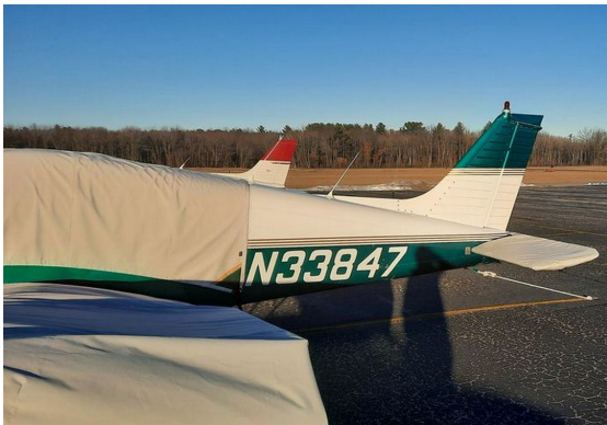
Piper PA-28 Horizontal Stabilizer Cover