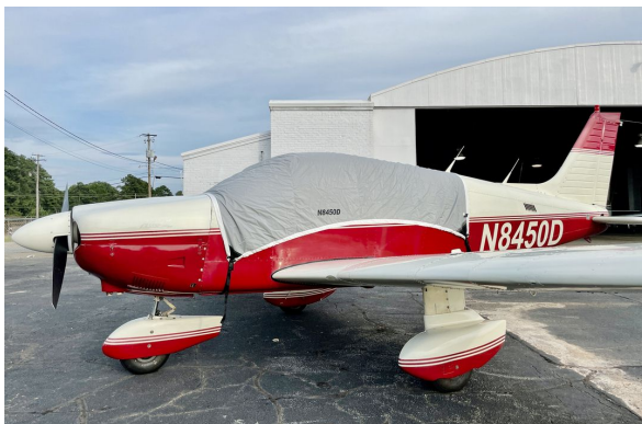
Piper PA-28 Travel cover

Travel Covers are made with Silver Solution-Dyed Polyester fabric and only lined over the windshield to save weight. The material is lightweight and more compact for easy stowage in the aircraft. The polyester material is water resistant, but only intended for occasional use outside. We also have an ultra lightweight material available for fitted hangar dust covers. For daily outdoor use, the non-travel Sunbrella Cover is the best choice.