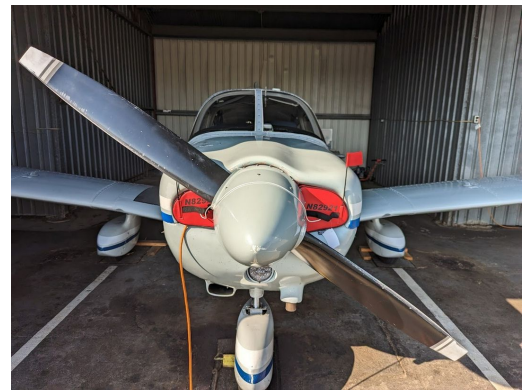
Piper PA-28-181 Engine Inlet Plugs