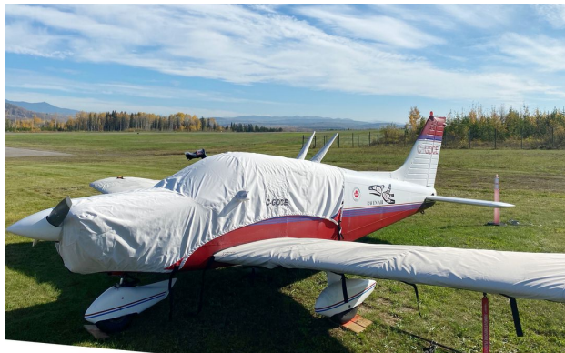
Piper PA28-140 Canopy/Engine Cover

WINTER USE MATERIAL - Made with Solution-Dyed Polyester fabric, this option is intended for seasonal use to aid in deicing, rain mitigation, or for occasional travel. The material is lighter and more compact, but more susceptible to UV damage and may have a shorter useful life if used continuously outside than the all-year use material.