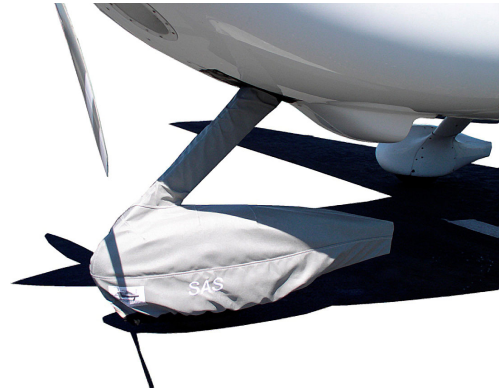
Cirrus Front Wheelpant/Strut Cover