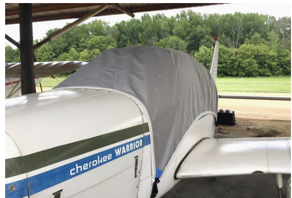
Piper PA-28-151 Travel Light Weight Canopy Cover