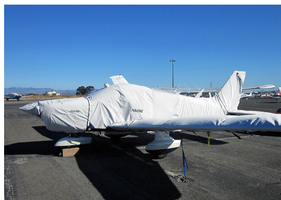
Piper PA-28 Full Cover Set