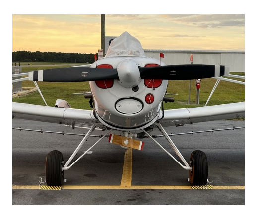
Piper PA-25 Pawnee Canopy/Hopper Cover