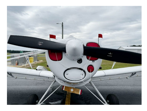
Piper Pawnee PA25 Engine Inlet Plugs

Engine Inlet Plugs are custom fit for your Piper Pawnee PA-25 intakes, made with heavy-duty vinyl material, and stuffed with a single block of sculpted urethane foam. Each plug has a zipper that allows the foam to be removed and dried if necessary. Engine plugs have warning flags that are visible from the cockpit or 'remove before flight' streamers sewn onto the face of the plugs. Most plugs are imprinted with the aircraft registration number in black for an extra charge. Storage bag NOT included. Engine plugs may be inserted after flight when the engine is still warm. Engine Inlet Plugs are commonly referred to as Cowl Plugs, Intake Plugs, Cowl Blocks, Engine Blocks, and Engine Bungs.