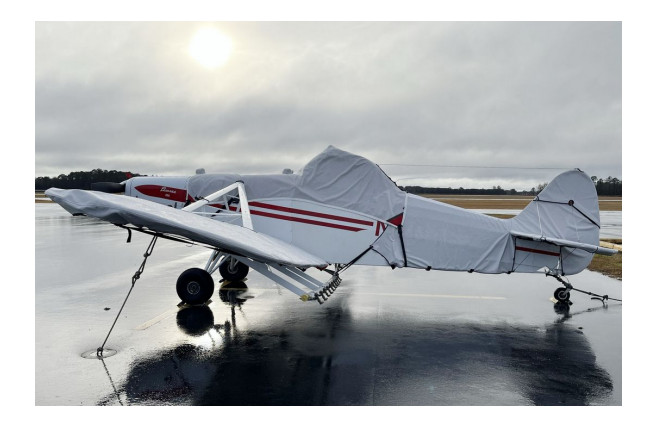
Piper Pawnee Canopy/Hopper, Wing & Empennage Covers

WINTER USE MATERIAL - Made with Solution-Dyed Polyester fabric, this option is intended for seasonal use to aid in deicing, rain mitigation, or for occasional travel. The material is lighter and more compact, but more susceptible to UV damage and may have a shorter useful life if used continuously outside than the all-year use material.