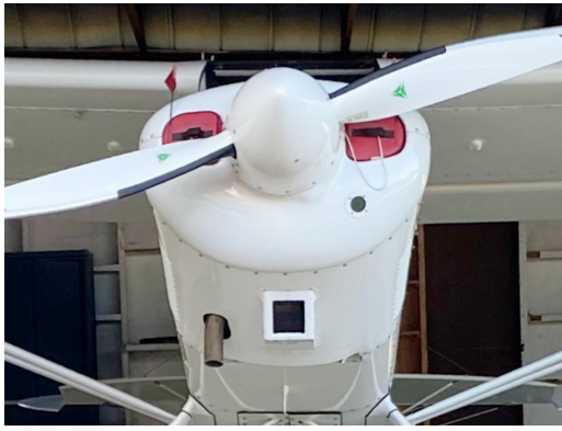
Piper PA-18 Super Cub Engine Plugs