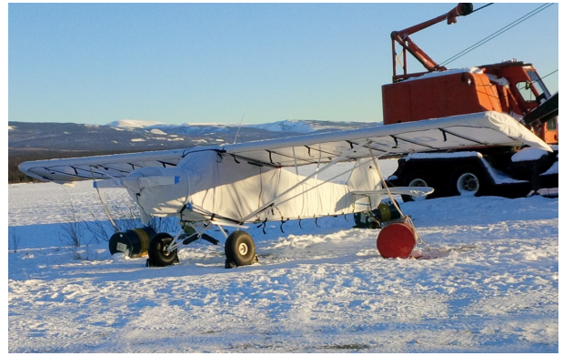
Piper Super Cub Complete Cover Set