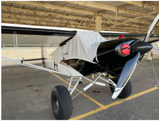
Piper PA-18 Super Cub Canopy Cover, Over Top Type