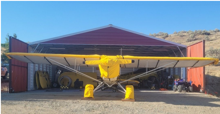
Piper PA-18 All Weather Cover Set