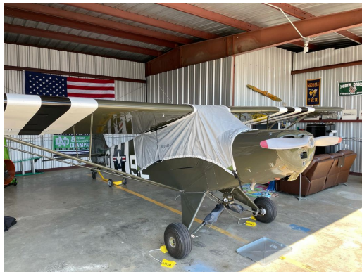
Piper PA-18 Super Cub L18-C Travel cover

This cover type is made from Silver Acrylic Sunbrella canvas and is 100% lined with a soft and smooth microfiber. Bruce's Custom Covers developed this material combination especially for aircraft protection. The outer material is medium weight and treated for water resistance, UV resistance and anti-static buildup. The inner lining is a very soft and smooth microfiber to prevent scratching. The material is very reflective, and tests show that the cabin interior temperature can be reduced to near-ambient temperature on the hottest of days. It is water, ice and snow repellent, yet breathable to allow moisture to escape from between the cover and the aircraft surface.