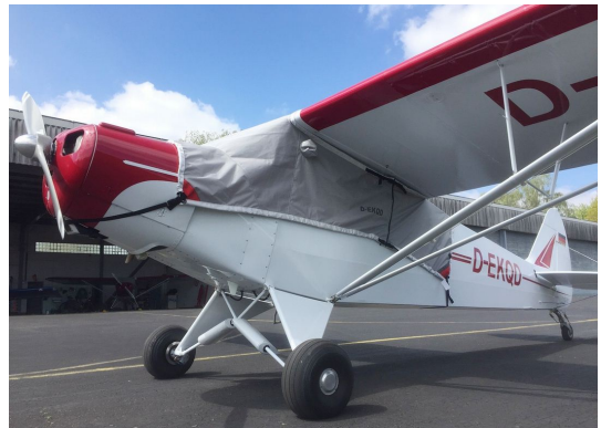
Piper Super Cub Travel Weight Canopy Cover