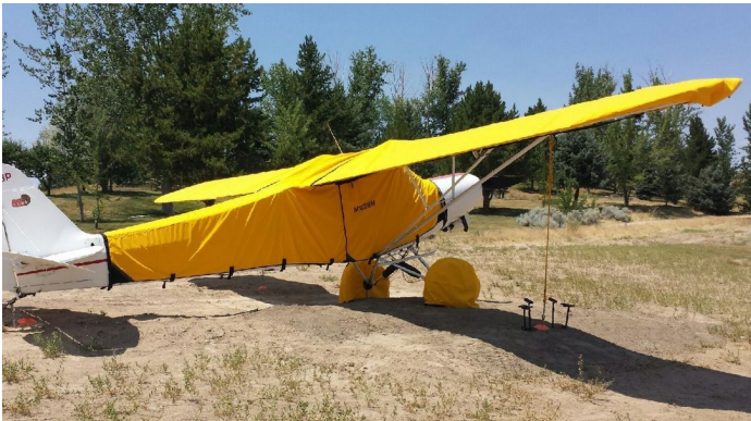
Cub Crafters CC19 Oversize Tire Covers, test fit cover Piper PA-18 Super Cub Extended Canopy Cover, Wing & Tire Covers