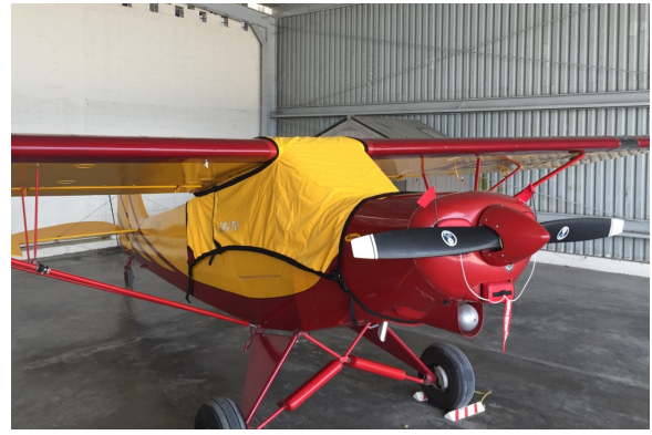
Piper Super Cub Canopy Cover, Engine Plugs