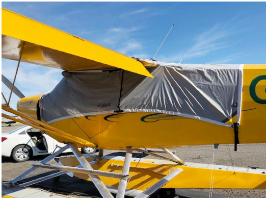
Sportsman 2+2 Wag Aero Light Weight Over the Top Travel Canopy Cover

This cover type is made from Silver Acrylic Sunbrella canvas and is 100% lined with a soft and smooth microfiber. Bruce's Custom Covers developed this material combination especially for aircraft protection. The outer material is medium weight and treated for water resistance, UV resistance and anti-static buildup. The inner lining is a very soft and smooth microfiber to prevent scratching. The material is very reflective, and tests show that the cabin interior temperature can be reduced to near-ambient temperature on the hottest of days. It is water, ice and snow repellent, yet breathable to allow moisture to escape from between the cover and the aircraft surface.