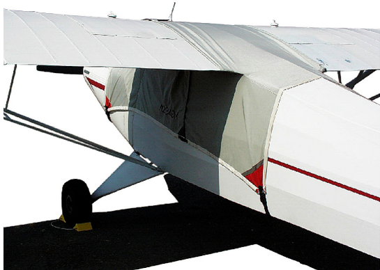
Piper PA-12 Super Cruiser Over-Top Canopy Cover