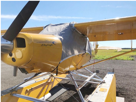
Sportsman 2+2 Wag Aero Light Weight Over the Top Travel Canopy Cover