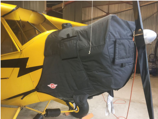
Piper J3 Cub Insulated Engine Cover

This cover type is made from Silver Acrylic Sunbrella canvas and is 100% lined with a soft and smooth microfiber. Bruce's Custom Covers developed this material combination especially for aircraft protection. The outer material is medium weight and treated for water resistance, UV resistance and anti-static buildup. The inner lining is a very soft and smooth microfiber to prevent scratching. The material is very reflective, and tests show that the cabin interior temperature can be reduced to near-ambient temperature on the hottest of days. It is water, ice and snow repellent, yet breathable to allow moisture to escape from between the cover and the aircraft surface.