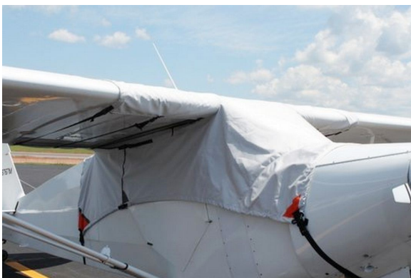
Piper PA-12 Super Cruiser Canopy Cover (Over-The-Top Style), extended to cover gas caps.

This cover type is made from Silver Acrylic Sunbrella canvas and is 100% lined with a soft and smooth microfiber. Bruce's Custom Covers developed this material combination especially for aircraft protection. The outer material is medium weight and treated for water resistance, UV resistance and anti-static buildup. The inner lining is a very soft and smooth microfiber to prevent scratching. The material is very reflective, and tests show that the cabin interior temperature can be reduced to near-ambient temperature on the hottest of days. It is water, ice and snow repellent, yet breathable to allow moisture to escape from between the cover and the aircraft surface.