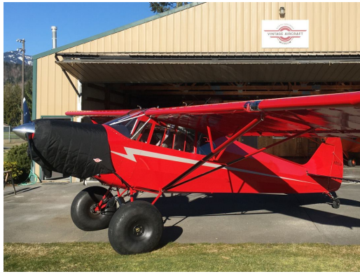
Piper PA-12 Insulated Engine Cover