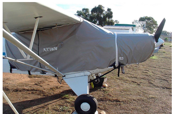
Piper PA-12 Super Cruiser Extended Over-the-Top Canopy Cover & Engine Cover