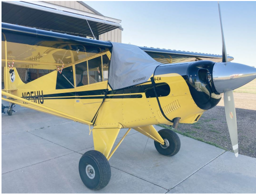
Aviat Husky Windshield/Skylight Cover