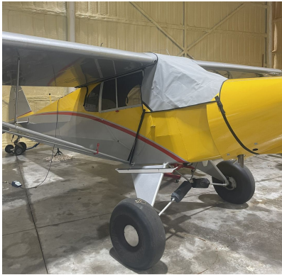
Piper PA-12: Super Cruiser Light Weight Travel Windshield/Skylight Cover

The material is very reflective, and tests show that the cabin interior temperature can be reduced to near-ambient temperature on the hottest of days. It is water, ice and snow repellent, yet breathable to allow moisture to escape from between the cover and the aircraft surface.