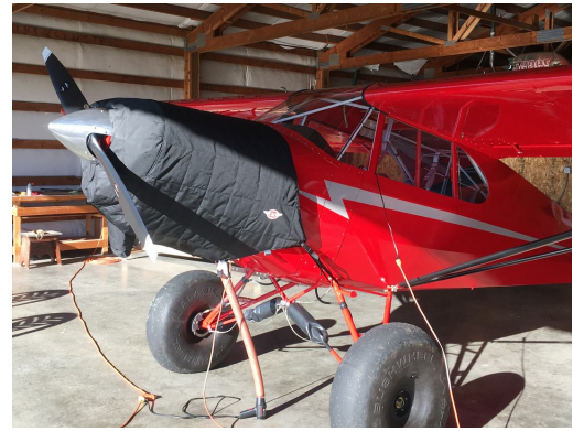
Piper PA-12 Insulated Engine Cover