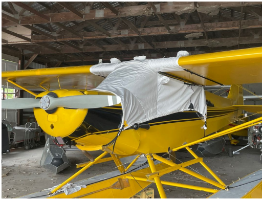
Piper PA-11 Over-Top Canopy Cover, extends to cover gas caps