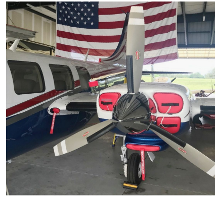
Piper Aerostar Engine Plugs