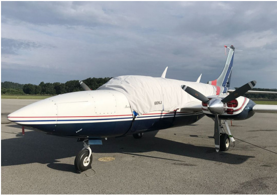
Smith Aerostar 600 Canopy Cover