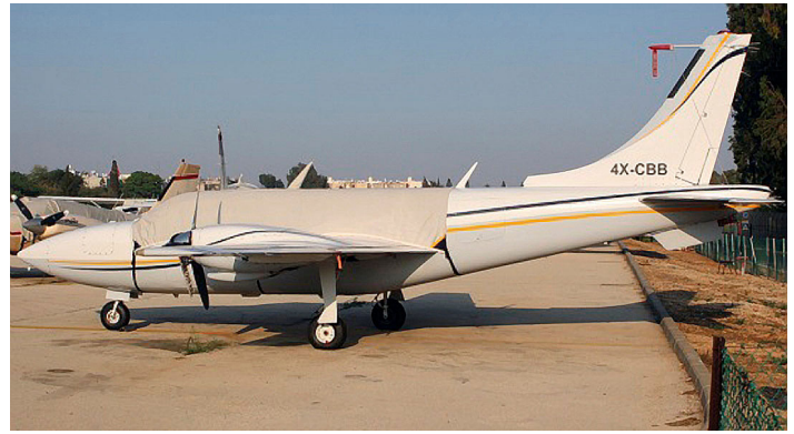
Piper Aerostar Canopy Cover