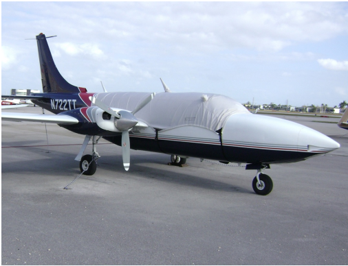
Aerostar Canopy Cover

The Piper PA-601 Aerostar Nose Cover is designed to cover the section of the fuselage forward of the windshield to the tip of the nose. It is secured with belly strapsThis cover type is made from Silver Acrylic Sunbrella canvas and is 100% lined with a soft and smooth microfiber. Bruce's Custom Covers developed this material combination especially for aircraft protection. The outer material is medium weight and treated for water resistance, UV resistance and anti-static buildup. The inner lining is a very soft and smooth microfiber to prevent scratching. The material is very reflective, and tests show that the cabin interior temperature can be reduced to near-ambient temperature on the hottest of days. It is water, ice and snow repellent, yet breathable to allow moisture to escape from between the cover and the aircraft surface.