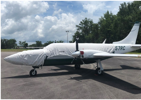
Piper Aerostar Canopy & Nose Covers, Engine Plugs