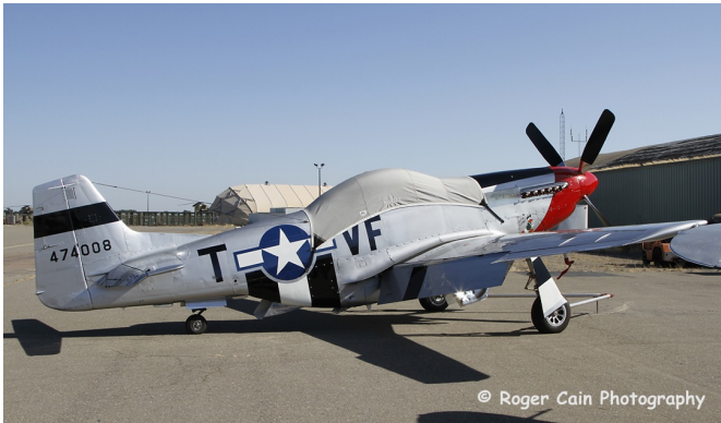
North American P-51 Canopy Cover