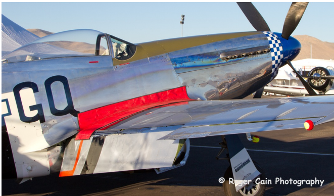
North American P-51 Wing Walk Pad

WINTER USE MATERIAL - Made with Solution-Dyed Polyester fabric, this option is intended for seasonal use to aid in deicing, rain mitigation, or for occasional travel. The material is lighter and more compact, but more susceptible to UV damage and may have a shorter useful life if used continuously outside than the all-year use material.