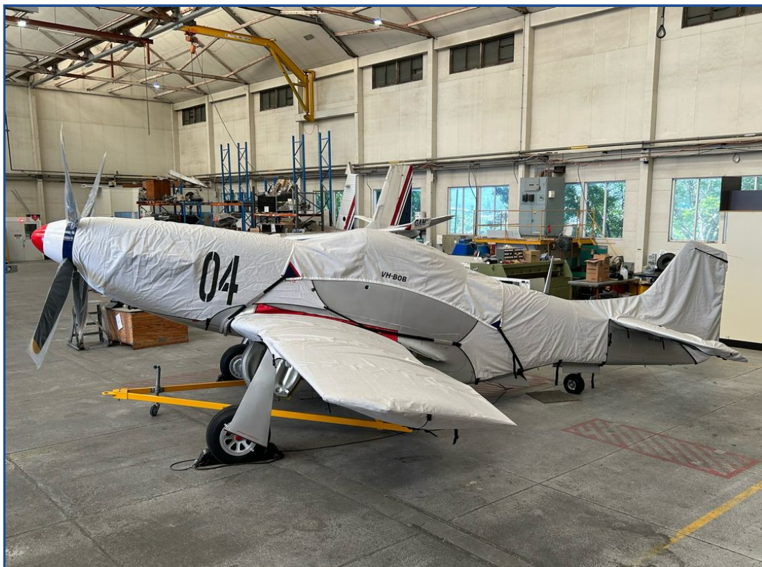
North American Mustang P51 Engine Cover