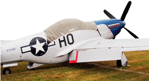
North American P51 Canopy Cover & Engine Plugs