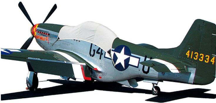
North American P51 Canopy Cover & Exhaust Plugs

non-travel Sunbrella Cover is the best choice.