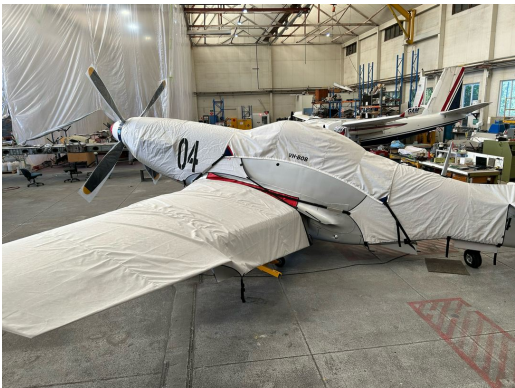
North American Mustang P51 Engine Cover