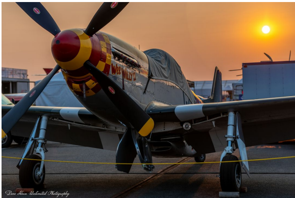
North American P-51 Canopy Cover

This cover type is made from Silver Acrylic Sunbrella canvas and is 100% lined with a soft and smooth microfiber. Bruce's Custom Covers developed this material combination especially for aircraft protection. The outer material is medium weight and treated for water resistance, UV resistance and anti-static buildup. The inner lining is a very soft and smooth microfiber to prevent scratching. The material is very reflective, and tests show that the cabin interior temperature can be reduced to near-ambient temperature on the hottest of days. It is water, ice and snow repellent, yet breathable to allow moisture to escape from between the cover and the aircraft surface.