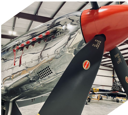
North American TF-51D Exhaust Plugs

Engine Inlet Plugs are custom fit for your North American Mustang P51 intakes, made with heavy-duty vinyl material, and stuffed with a single block of sculpted urethane foam. Each plug has a zipper that allows the foam to be removed and dried if necessary. Engine plugs have warning flags that are visible from the cockpit or 'remove before flight' streamers sewn onto the face of the plugs. Most plugs are imprinted with the aircraft registration number in black for an extra charge. Storage bag NOT included. Engine plugs may be inserted after flight when the engine is still warm. Engine Inlet Plugs are commonly referred to as Cowl Plugs, Intake Plugs, Cowl Blocks, Engine Blocks, and Engine Bungs.