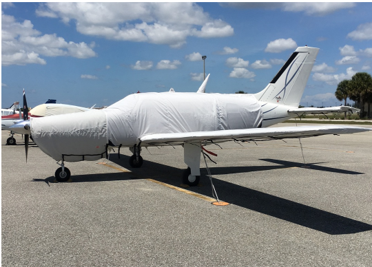
Piper PA-46-350P Cockpit Cover, Engine Plugs Piper Malibu Extended Canopy Cover, Engine, Wing & Horiz. Stab. Covers