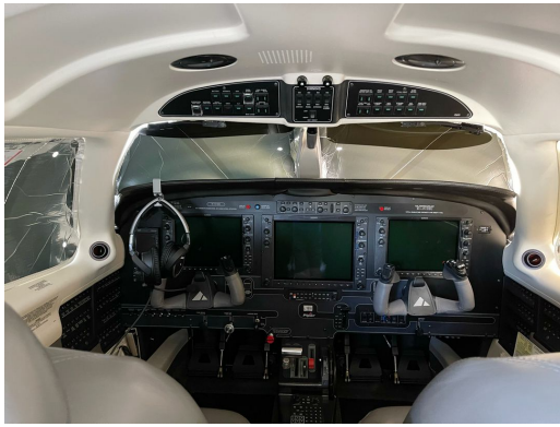
Piper PA46-500TP Cockpit Heatshields