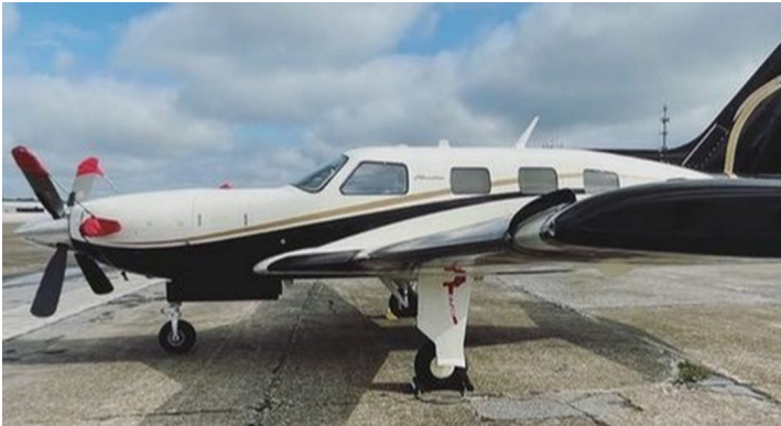
Piper PA-46-500TP prop tie/exhaust cover set

This cover type is made from Silver Acrylic Sunbrella canvas and is 100% lined with a soft and smooth microfiber. Bruce's Custom Covers developed this material combination especially for aircraft protection. The outer material is medium weight and treated for water resistance, UV resistance and anti-static buildup. The inner lining is a very soft and smooth microfiber to prevent scratching. The material is very reflective, and tests show that the cabin interior temperature can be reduced to near-ambient temperature on the hottest of days. It is water, ice and snow repellent, yet breathable to allow moisture to escape from between the cover and the aircraft surface.