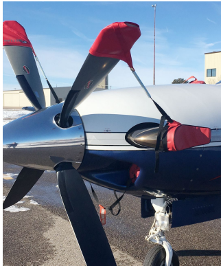
Piper PA46TP-500 Meridian Prop Tie/Exhaust Covers, Engine Plugs

Engine Inlet Plugs are custom fit for your Piper PA-46-500TP, 600TP Meridian, M500, M600, M700 intakes, made with heavy-duty vinyl material, and stuffed with a single block of sculpted urethane foam. Each plug has a zipper that allows the foam to be removed and dried if necessary. Engine plugs have warning flags that are visible from the cockpit or 'remove before flight' streamers sewn onto the face of the plugs. Most plugs are imprinted with the aircraft registration number in black for an extra charge. Storage bag NOT included. Engine plugs may be inserted after flight when the engine is still warm. Engine Inlet Plugs are commonly referred to as Cowl Plugs, Intake Plugs, Cowl Blocks, Engine Blocks, and Engine Bungs.