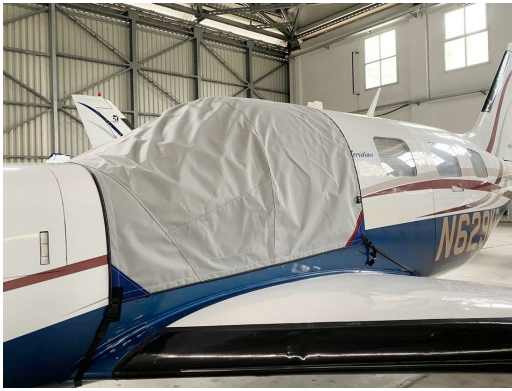
Piper PA-46-500TP Travel Cover Cockpit Cover