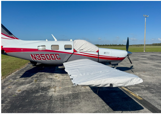
Piper PA 46-350P Cockpit & Wing Covers