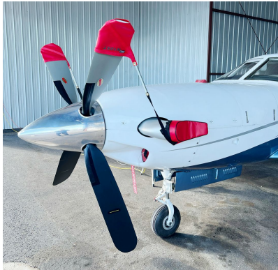
Piper Meridian Prop Tie/Exhaust Cover