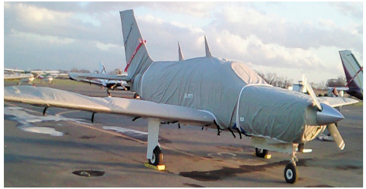
Piper PA-46 Malibu Complete Cover Set