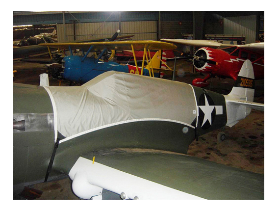
P40 Canopy Cover