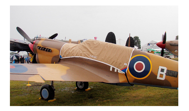
P40 Canopy Cover