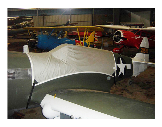
P40 Canopy Cover

the hottest of days. It is water, ice and snow repellent, yet breathable to allow moisture to escape from between the cover and the aircraft surface.