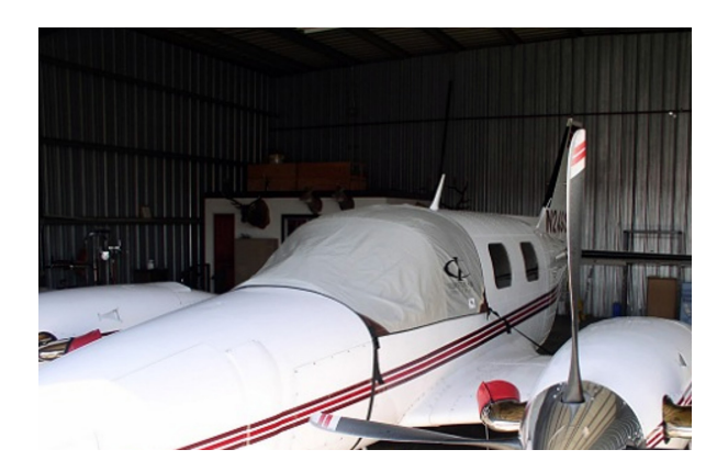
Piper Cheyenne Cockpit Cover

This cover type is made from Silver Acrylic Sunbrella canvas and is 100% lined with a soft and smooth microfiber. Bruce's Custom Covers developed this material combination especially for aircraft protection. The outer material is medium weight and treated for water resistance, UV resistance and anti-static buildup. The inner lining is a very soft and smooth microfiber to prevent scratching. The material is very reflective, and tests show that the cabin interior temperature can be reduced to near-ambient temperature on the hottest of days. It is water, ice and snow repellent, yet breathable to allow moisture to escape from between the cover and the aircraft surface.