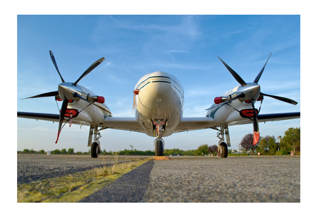
Piper Cheyenne Intake Plugs, Exhaust Covers, Prop Ties