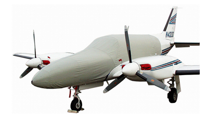
Piper Navajo CR Canopy/Nose Cover