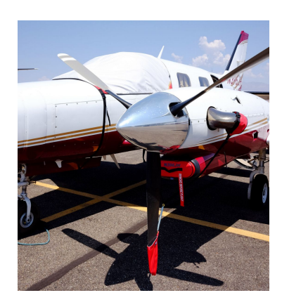
Piper Cheyenne Cockpit Cover, Engine Plugs, Prop Tie/Exhaust Covers

non-travel Sunbrella Cover is the best choice.