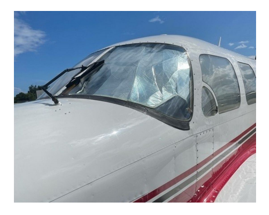
Piper PA-31 Models Cockpit HeatShields

for cockpit overheating, but an external fabric cover is more effective for long-term protection.