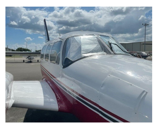
Piper PA-31 Models Cockpit HeatShields