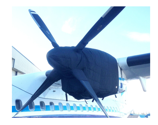
Piper Chevenne Cockpit Cover, Engine Plugs, Prop Tie/Exhaust Covers