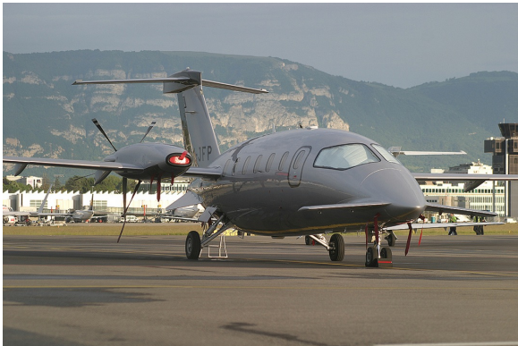
Piaggio 180 Cockpit HeatShields