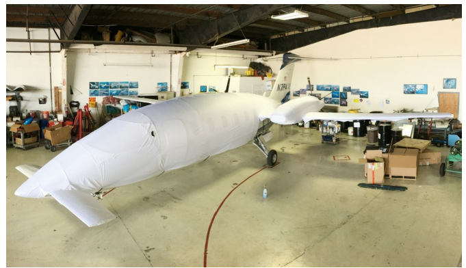
Piaggio P180 Fuselage/Canard Cover & Wing/Engine Covers (test fit covers) Piaggio P180 Fuselage/Canard Cover & Wing/Engine Covers (test fit covers)