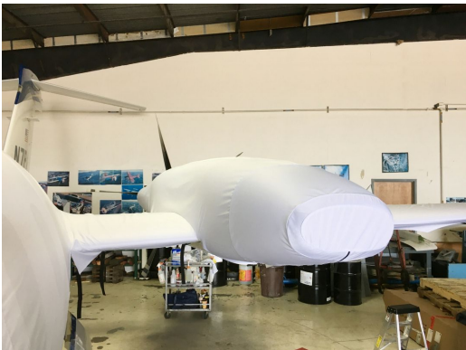
Piaggio P180 Fuselage/Canard Cover & Wing/Engine Covers (test fit covers) Piaggio P180 Fuselage/Canard Cover & Wing/Engine Covers (test fit covers)