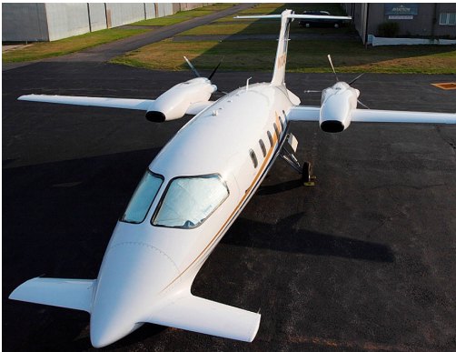
Piaggio 180 Cockpit HeatShields

Cockpit Heatshields are interior sunshades for the aircraft's cockpit. The product is a unique composite of closed-cell foam with a silver mylar finish. The semi-rigid design is stiff enough to stand inside the window framing. The set folds up flat and is easily stored in the included storage sleeve. Some designs may require velcro and suction cups. A Heatshield is an excellent short-term remedy for cockpit overheating, but an external fabric cover is more effective for long-term protection.