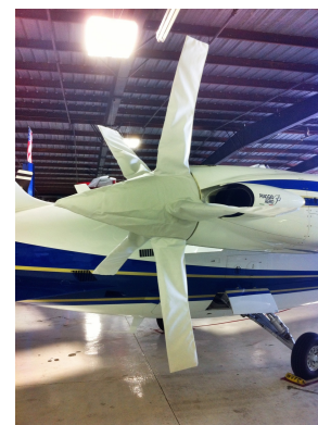
Piaggio 180 5-Blade Prop/Hub Cover