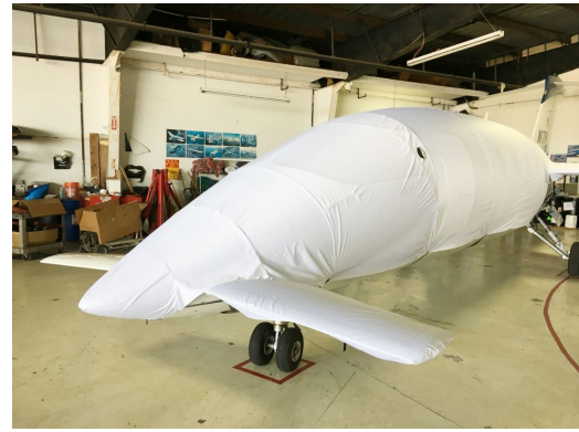
Piaggio P180 Fuselage/Canard Cover & Wing/Engine Covers (test fit covers)