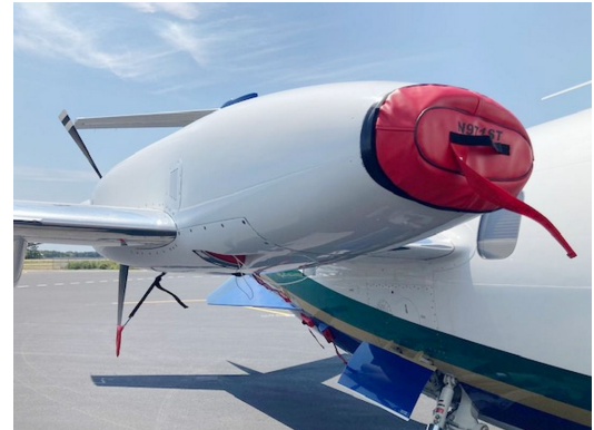
Piaggio P180 Intake Plugs with Fabric Extension