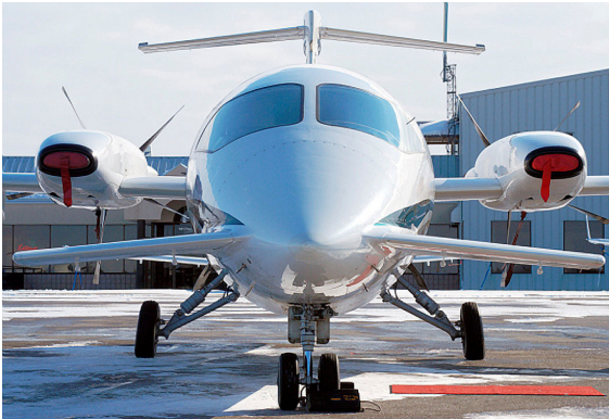
Piaggio 180 Engine Plugs

Engine Inlet Plugs are custom fit for your Piaggio Avanti P180 intakes, made with heavy-duty vinyl material, and stuffed with a single block of sculpted urethane foam. Each plug has a zipper that allows the foam to be removed and dried if necessary. Engine plugs have warning flags that are visible from the cockpit or 'remove before flight' streamers sewn onto the face of the plugs. Most plugs are imprinted with the aircraft registration number in black for an extra charge. Storage bag NOT included. Engine plugs may be inserted after flight when the engine is still warm. Engine Inlet Plugs are commonly referred to as Cowl Plugs, Intake Plugs, Cowl Blocks, Engine Blocks, and Engine Bungs.