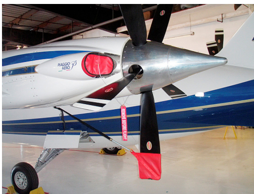
Piaggio 180 Exhaust Covers, Prop Ties

This cover type is made from Silver Acrylic Sunbrella canvas and is 100% lined with a soft and smooth microfiber. Bruce's Custom Covers developed this material combination especially for aircraft protection. The outer material is medium weight and treated for water resistance, UV resistance and anti-static buildup. The inner lining is a very soft and smooth microfiber to prevent scratching. The material is very reflective, and tests show that the cabin interior temperature can be reduced to near-ambient temperature on the hottest of days. It is water, ice and snow repellent, yet breathable to allow moisture to escape from between the cover and the aircraft surface.