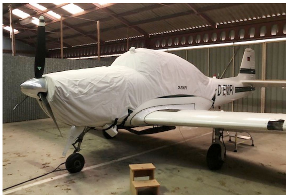
Piaggio FW-149D Canopy/Engine Cover

Cover and Engine Cover. This cover will enclose the engine cowl and will extend aft to cover all of the windows. This cover type is made from Silver Acrylic Sunbrella canvas and is 100% lined with a soft and smooth microfiber. Bruce's Custom Covers developed this material combination especially for aircraft protection. The outer material is medium weight and treated for water resistance, UV resistance and anti-static buildup. The inner lining is a very soft and smooth microfiber to prevent scratching. The material is very reflective, and tests show that the cabin interior temperature can be reduced to near-ambient temperature on the hottest of days. It is water, ice and snow repellent, yet breathable to allow moisture to escape from between the cover and the aircraft surface.