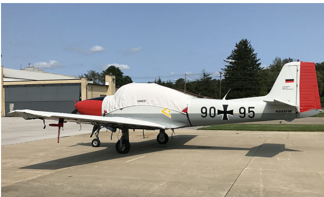
Focke Wulf F149 Canopy Cover, Wing Covers