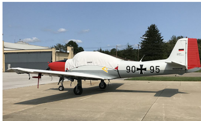
Focke Wulf F149 Canopy Cover, Wing Covers