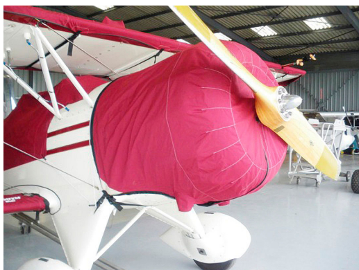
Waco UPF-7 Engine Cover