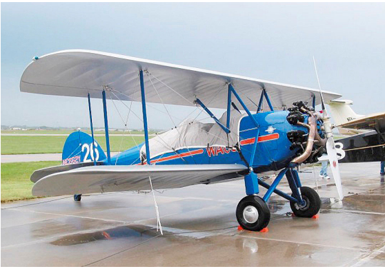
Waco ASO Canopy Cover