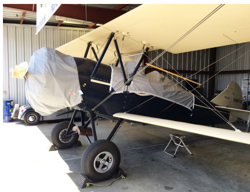
Travel Air 4000 Canopy and Engine Covers, light weight travel type