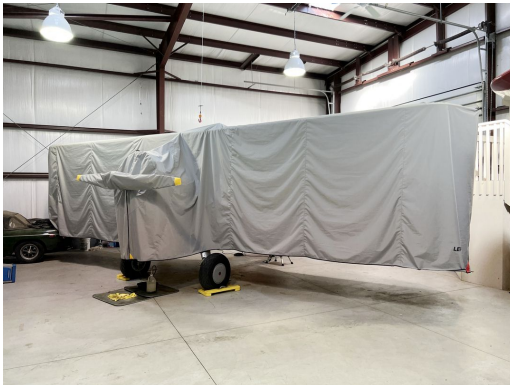
Stearman PT-13 Full Body Dust Cover, Prop Cover Included

Some high value aircraft end up logging lots of hangar time, and become dust magnets in the process. A high quality, well fitting dust cover provides easy assurance that the aircraft's surfaces remain clean and free of grit and grime. Available in a large variety of colors, each dust cover is custom made according to aircraft details and customer preferences. Fire retardant fabrics are also available.