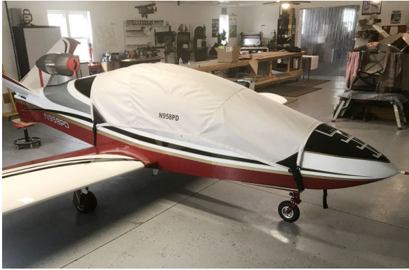
Subsonex Canopy Cover