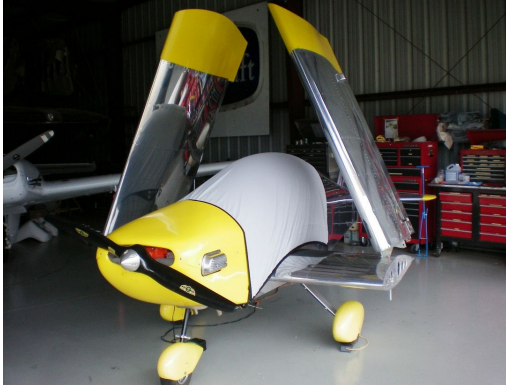
Onex Flyaway Cover

Travel Covers are made with Silver Solution-Dyed Polyester fabric and only lined over the windshield to save weight. The material is lightweight and more compact for easy stowage in the aircraft. The polyester material is water resistant, but only intended for occasional use outside. We also have an ultra lightweight material available for fitted hangar dust covers. For daily outdoor use, the non-travel Sunbrella Cover is the best choice.