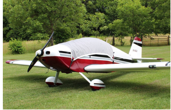
OneX Canopy Cover