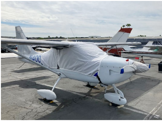
OMF Symphony 160 Canopy Cover, Over Top Type