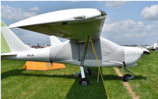
Glstar Travel Cover

This cover type is made from Silver Acrylic Sunbrella canvas and is 100% lined with a soft and smooth microfiber. Bruce's Custom Covers developed this material combination especially for aircraft protection. The outer material is medium weight and treated for water resistance, UV resistance and anti-static buildup. The inner lining is a very soft and smooth microfiber to prevent scratching. The material is very reflective, and tests show that the cabin interior temperature can be reduced to near-ambient temperature on the hottest of days. It is water, ice and snow repellent, yet breathable to allow moisture to escape from between the cover and the aircraft surface.