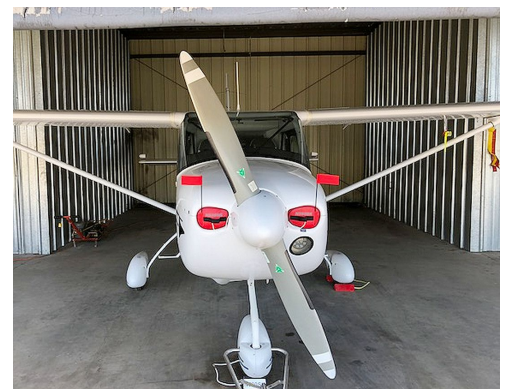
2006 OMF Symphony SA160