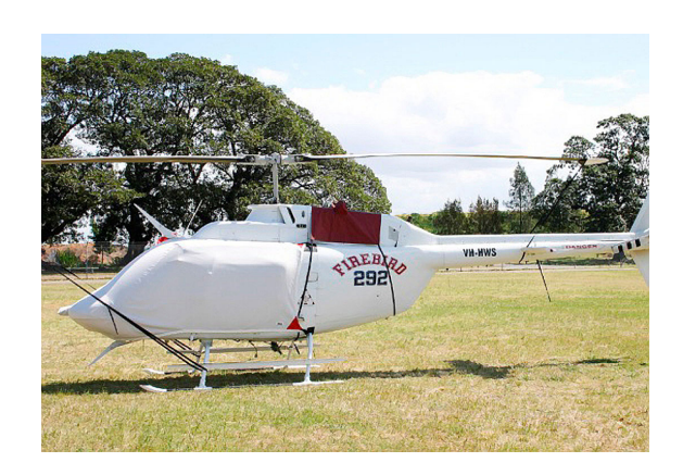
206B Bubble Cover