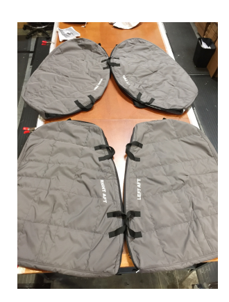
MD 500D Padded Door Bags

**Padded Door Bags* are designed to provide portable protection of the doors when they are removed from the aircraft. They are padded to moderate thickness, zippered closed, and have sturdy carry handles for easy transport.