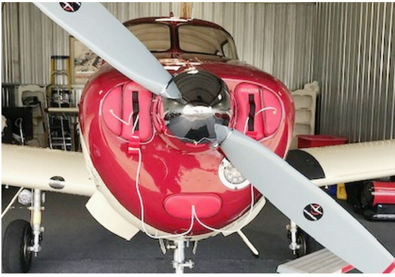
Ryan Navion B Engine Inlet Plugs