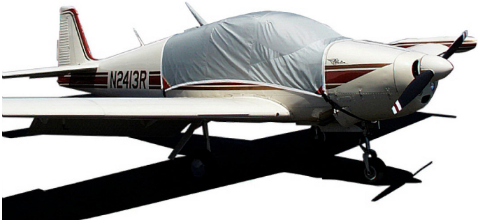
Covers & Plugs for the Navion Rangemaster