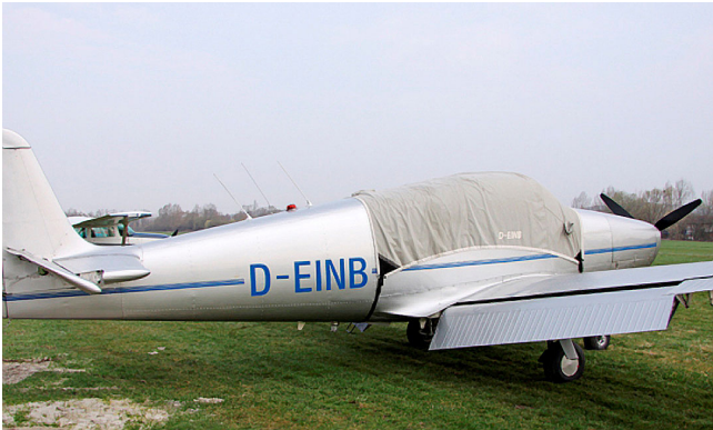
Navion Rangemaster Canopy Cover

This cover type is made from Silver Acrylic Sunbrella canvas and is 100% lined with a soft and smooth microfiber. Bruce's Custom Covers developed this material combination especially for aircraft protection. The outer material is medium weight and treated for water resistance, UV resistance and anti-static buildup. The inner lining is a very soft and smooth microfiber to prevent scratching. The material is very reflective, and tests show that the cabin interior temperature can be reduced to near-ambient temperature on the hottest of days. It is water, ice and snow repellent, yet breathable to allow moisture to escape from between the cover and the aircraft surface.