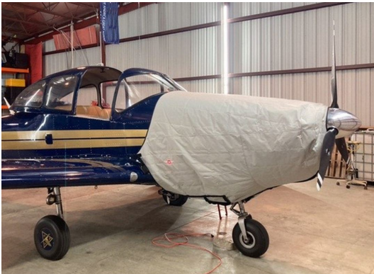
Navion Insulated Engine Cover

This cover type is made from Silver Acrylic Sunbrella canvas and is 100% lined with a soft and smooth microfiber. Bruce's Custom Covers developed this material combination especially for aircraft protection. The outer material is medium weight and treated for water resistance, UV resistance and anti-static buildup. The inner lining is a very soft and smooth microfiber to prevent scratching. The material is very reflective, and tests show that the cabin interior temperature can be reduced to near-ambient temperature on the hottest of days. It is water, ice and snow repellent, yet breathable to allow moisture to escape from between the cover and the aircraft surface.