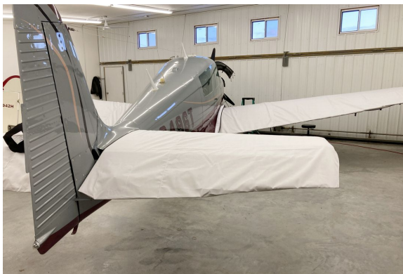
Navion Rangemaster Wing & Horizontal Stabilizer Covers

mitigation, or for occasional travel. The material is lighter and more compact, but more susceptible to UV damage and may have a shorter useful life if used continuously outside than the all-year use material.