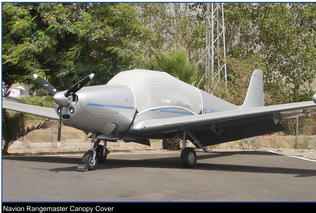
Navion Rangemaster Canopy Cover