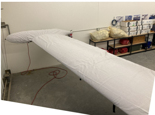
Navion Rangemaster Wing Covers