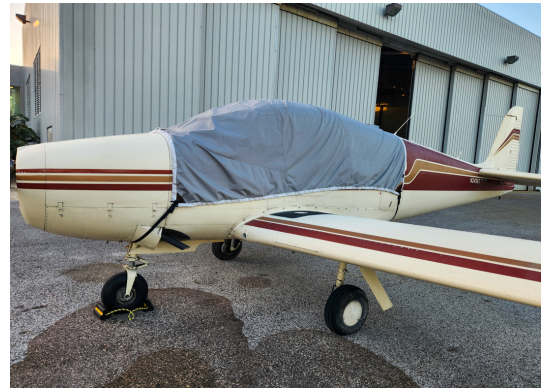
Navion Rangemaster Travel Cover, Light Weight Canopy Cover, Navion Rangemaster Travel Cover, Light Weight Canopy Cover, (Super Slope windshield) (Super Slope windshield)