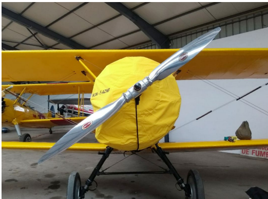
N3N Engine Cover

This cover type is made from Silver Acrylic Sunbrella canvas and is 100% lined with a soft and smooth microfiber. Bruce's Custom Covers developed this material combination especially for aircraft protection. The outer material is medium weight and treated for water resistance, UV resistance and anti-static buildup. The inner lining is a very soft and smooth microfiber to prevent scratching. The material is very reflective, and tests show that the cabin interior temperature can be reduced to near-ambient temperature on the hottest of days. It is water, ice and snow repellent, yet breathable to allow moisture to escape from between the cover and the aircraft surface.