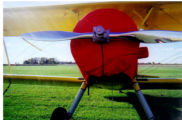
Stearman Engine Cover