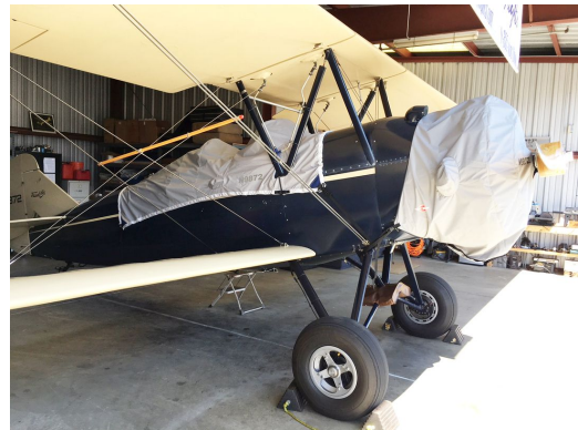
Boeing Stearman PT-13 Canopy, Wing & Horiz. Stab Covers Travel Air 4000 Canopy and Engine Covers, light weight travel type