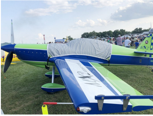
MX2 Lightweight Travel Canopy Cover