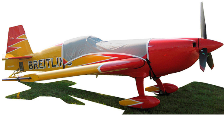
Extra 300sc Canopy Cover