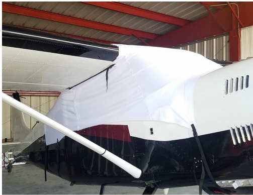
Murphy Moose Canopy Cover (test fit cover)