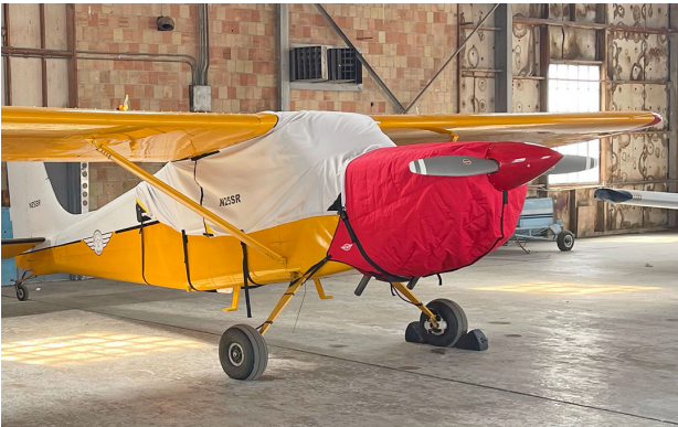
Murphy Super Rebel Insulated Engine Cover

This cover type is made from Silver Acrylic Sunbrella canvas and is 100% lined with a soft and smooth microfiber. Bruce's Custom Covers developed this material combination especially for aircraft protection. The outer material is medium weight and treated for water resistance, UV resistance and anti-static buildup. The inner lining is a very soft and smooth microfiber to prevent scratching. The material is very reflective, and tests show that the cabin interior temperature can be reduced to near-ambient temperature on the hottest of days. It is water, ice and snow repellent, yet breathable to allow moisture to escape from between the cover and the aircraft surface.