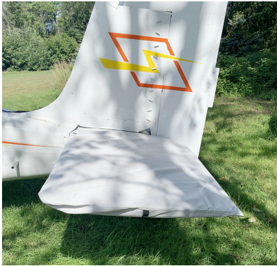
Murphy Elite Horizontal Stabilizer Covers