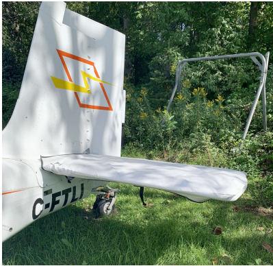
Murphy Elite Horizontal Stabilizer Covers

WINTER USE MATERIAL - Made with Solution-Dyed Polyester fabric, this option is intended for seasonal use to aid in deicing, rain mitigation, or for occasional travel. The material is lighter and more compact, but more susceptible to UV damage and may have a shorter useful life if used continuously outside than the all-year use material.