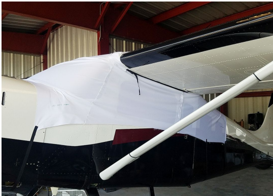
Murphy Moose Canopy Cover (test fit cover)

Covers developed this material combination especially for aircraft protection. The outer material is medium weight and treated for water resistance, UV resistance and anti-static buildup. The inner lining is a very soft and smooth microfiber to prevent scratching. The material is very reflective, and tests show that the cabin interior temperature can be reduced to near-ambient temperature on the hottest of days. It is water, ice and snow repellent, yet breathable to allow moisture to escape from between the cover and the aircraft surface.