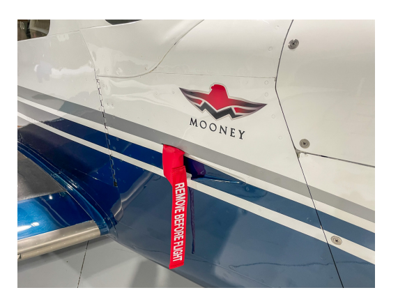
Mooney NACA Vent Plug