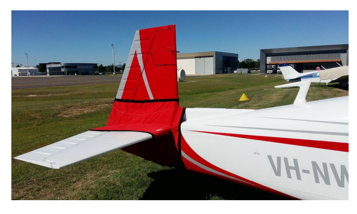
Mooney M20J Tailcone Cover