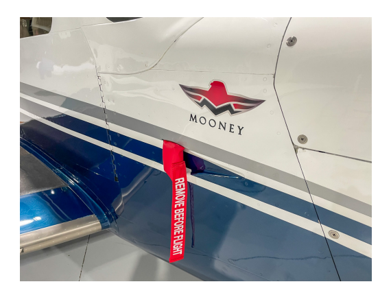
Mooney NACA Plug

Engine Inlet Plugs are custom fit for your Mooney Ovation & Ovation Ultra intakes, made with heavy-duty vinyl material, and stuffed with a single block of sculpted urethane foam. Each plug has a zipper that allows the foam to be removed and dried if necessary. Engine plugs have warning flags that are visible from the cockpit or 'remove before flight' streamers sewn onto the face of the plugs. Most plugs are imprinted with the aircraft registration number in black for an extra charge. Storage bag NOT included. Engine plugs may be inserted after flight when the engine is still warm. Engine Inlet Plugs are commonly referred to as Cowl Plugs, Intake Plugs, Cowl Blocks, Engine Blocks, and Engine Bungs.