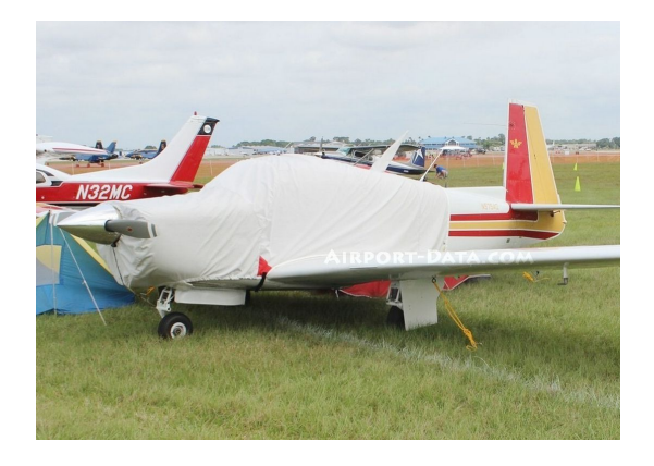
Mooney M20C Extended Canopy/Engine Cover