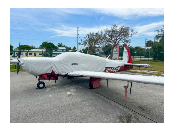
Mooney M20M Extended Canopy, Engine & Wing Covers

This cover type is made from Silver Acrylic Sunbrella canvas and is 100% lined with a soft and smooth microfiber. Bruce's Custom Covers developed this material combination especially for aircraft protection. The outer material is medium weight and treated for water resistance, UV resistance and anti-static buildup. The inner lining is a very soft and smooth microfiber to prevent scratching. The material is very reflective, and tests show that the cabin interior temperature can be reduced to near-ambient temperature on the hottest of days. It is water, ice and snow repellent, yet breathable to allow moisture to escape from between the cover and the aircraft surface.