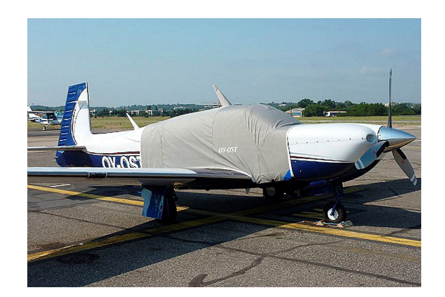
Mooney Ovation Extended Canopy Cover

This cover type is made from Silver Acrylic Sunbrella canvas and is 100% lined with a soft and smooth microfiber. Bruce's Custom Covers developed this material combination especially for aircraft protection. The outer material is medium weight and treated for water resistance, UV resistance and anti-static buildup. The inner lining is a very soft and smooth microfiber to prevent scratching. The material is very reflective, and tests show that the cabin interior temperature can be reduced to near-ambient temperature on the hottest of days. It is water, ice and snow repellent, yet breathable to allow moisture to escape from between the cover and the aircraft surface.