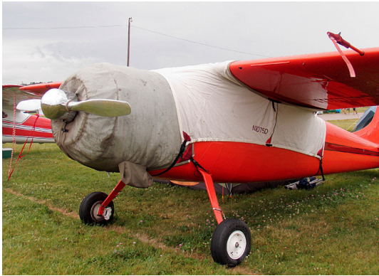
Cessna 195 Over-Top Canopy Cover & Engine Cover

The material is very reflective, and tests show that the cabin interior temperature can be reduced to near-ambient temperature on the hottest of days. It is water, ice and snow repellent, yet breathable to allow moisture to escape from between the cover and the aircraft surface.