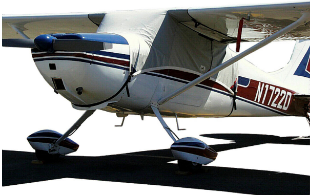
Over-the-Top Canopy Cover