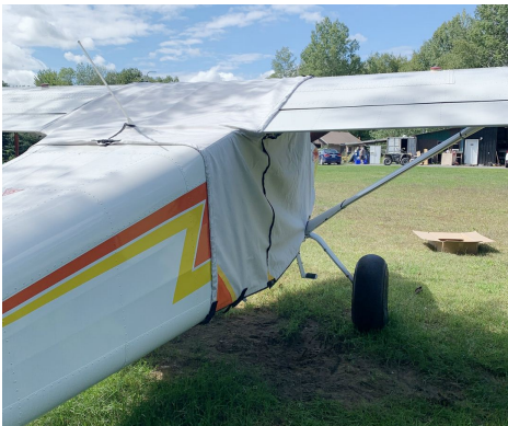
Murphy Elite Over The Top Style Extended Canopy Cover

This cover type is made from Silver Acrylic Sunbrella canvas and is 100% lined with a soft and smooth microfiber. Bruce's Custom Covers developed this material combination especially for aircraft protection. The outer material is medium weight and treated for water resistance, UV resistance and anti-static buildup. The inner lining is a very soft and smooth microfiber to prevent scratching. The material is very reflective, and tests show that the cabin interior temperature can be reduced to near-ambient temperature on the hottest of days. It is water, ice and snow repellent, yet breathable to allow moisture to escape from between the cover and the aircraft surface.