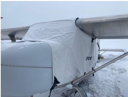
Murphy Rebel Canopy Cover, Over-Top Type