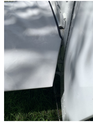
Murphy Elite Horizontal Stabilizer Covers