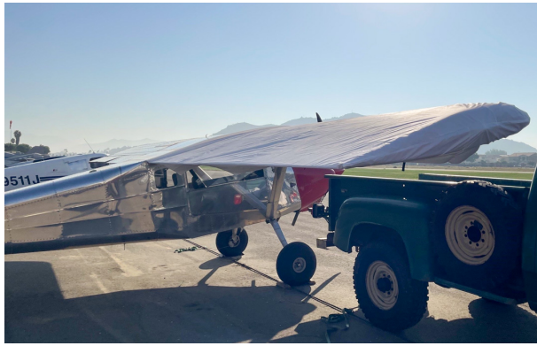
Murphy Elite Wing Covers, test fit cover