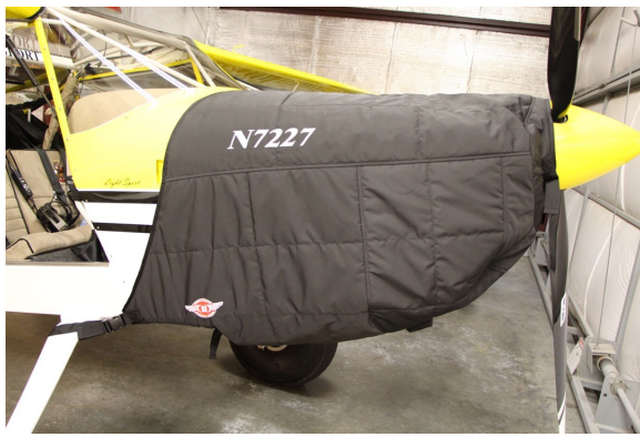
Kitfox Insulated Engine Cover