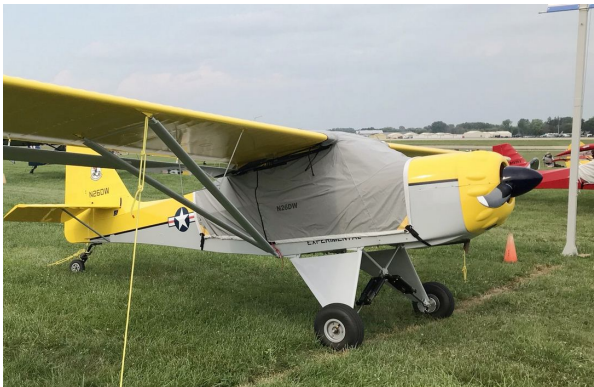
Kitfox Travel Canopy Cover