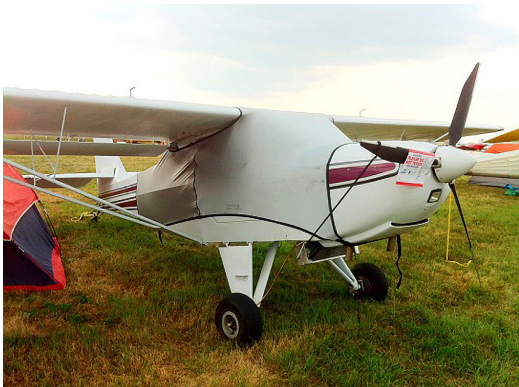
Kitfox Spandex FlyAway Travel Canopy Cover

Travel Covers are made with Silver Solution-Dyed Polyester fabric and only lined over the windshield to save weight. The material is lightweight and more compact for easy stowage in the aircraft. The polyester material is water resistant, but only intended for occasional use outside. We also have an ultra lightweight material available for fitted hangar dust covers. For daily outdoor use, the non-travel Sunbrella Cover is the best choice.