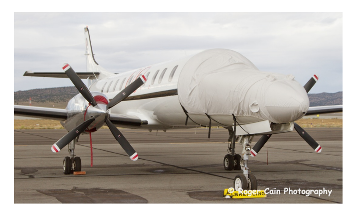
Merlin Cockpit/Nose Cover