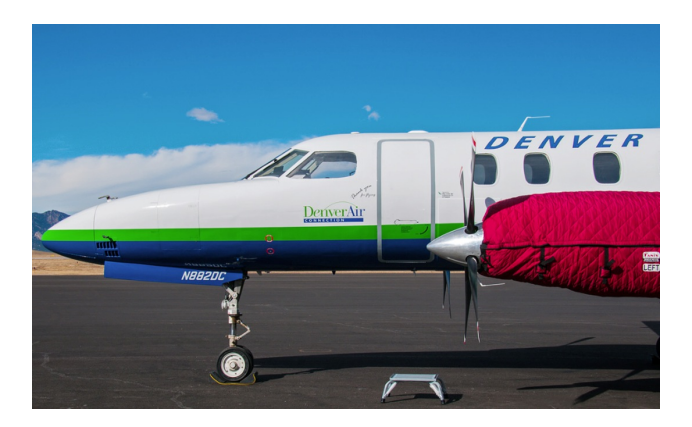
Merlin Insulated Engine Covers