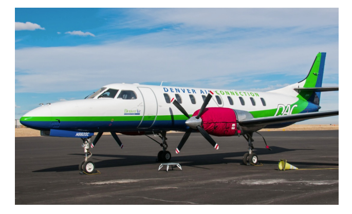
Merlin Insulated Engine Covers

This cover type is made from Silver Acrylic Sunbrella canvas and is 100% lined with a soft and smooth microfiber. Bruce's Custom Covers developed this material combination especially for aircraft protection. The outer material is medium weight and treated for water resistance, UV resistance and anti-static buildup. The inner lining is a very soft and smooth microfiber to prevent scratching. The material is very reflective, and tests show that the cabin interior temperature can be reduced to near-ambient temperature on the hottest of days. It is water, ice and snow repellent, yet breathable to allow moisture to escape from between the cover and the aircraft surface.