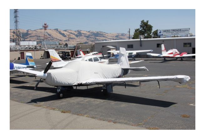
Mooney 231 Full Cover Set