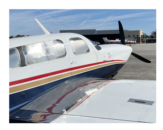
Mooney M20S Heatshield Set