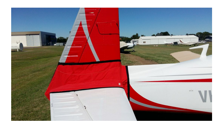
Mooney M20J Tailcone Cover

WINTER USE MATERIAL - Made with Solution-Dyed Polyester fabric, this option is intended for seasonal use to aid in deicing, rain mitigation, or for occasional travel. The material is lighter and more compact, but more susceptible to UV damage and may have a shorter useful life if used continuously outside than the all-year use material.