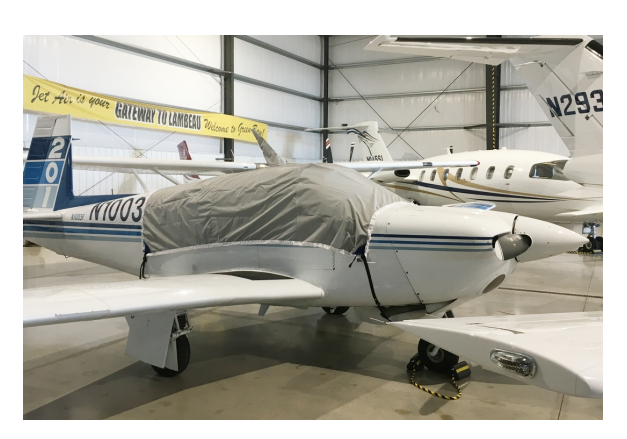
Mooney 201 Travel Cover, Light Weight Travel Canopy Cover, 5 Lbs