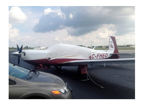
Mooney TLS Canopy Cover

This cover type is made from Silver Acrylic Sunbrella canvas and is 100% lined with a soft and smooth microfiber. Bruce's Custom Covers developed this material combination especially for aircraft protection. The outer material is medium weight and treated for water resistance, UV resistance and anti-static buildup. The inner lining is a very soft and smooth microfiber to prevent scratching. The material is very reflective, and tests show that the cabin interior temperature can be reduced to near-ambient temperature on the hottest of days. It is water, ice and snow repellent, yet breathable to allow moisture to escape from between the cover and the aircraft surface.