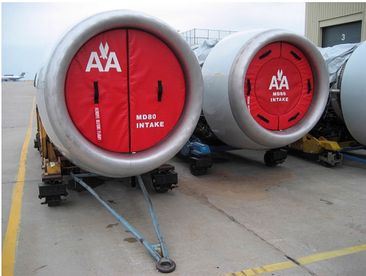
PW JT8D Off-Link Protective Long-term Storage "Rain Cap" Engine Cover