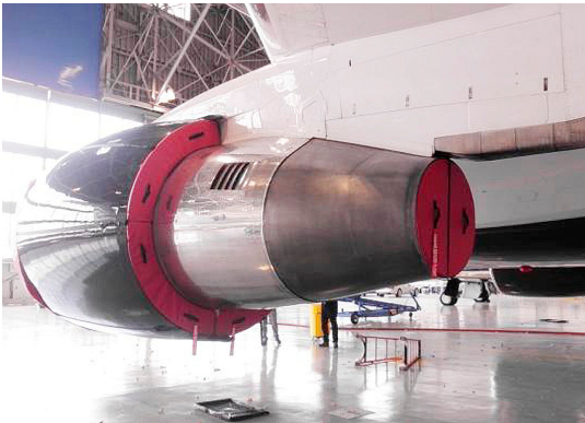
Exhaust Plugs Ship Set, incl. Fan Thrust Reverser and Exhaust Plugs P/N: B767-200

The Engine Inlet Plugs are custom fit for your McDonnell Douglas MD-11 intakes, made with heavy-duty vinyl material, and stuffed with a single block of sculpted urethane foam. Each plug has a zipper that allows the foam to be removed and dried if necessary. Engine plugs have 'remove before flight' streamers sewn onto the face of the plugs. Most plugs are imprinted with the aircraft registration number in black for an extra charge. Storage bag NOT included. Engine plugs may be inserted after flight when the engine is still warm. Engine Inlet Plugs are commonly referred to as Cowl Plugs, Intake Plugs, Cowl Blocks, Engine Blocks, and Engine Bungs.