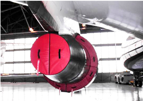
Exhaust Plugs Ship Set, incl. Fan Thrust Reverser and Exhaust Plugs P/N: B767-200