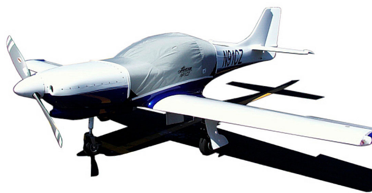
Canopy Cover for Lancair 320/360

This cover type is made from Silver Acrylic Sunbrella canvas and is 100% lined with a soft and smooth microfiber. Bruce's Custom Covers developed this material combination especially for aircraft protection. The outer material is medium weight and treated for water resistance, UV resistance and anti-static buildup. The inner lining is a very soft and smooth microfiber to prevent scratching. The material is very reflective, and tests show that the cabin interior temperature can be reduced to near-ambient temperature on the hottest of days. It is water, ice and snow repellent, yet breathable to allow moisture to escape from between the cover and the aircraft surface.