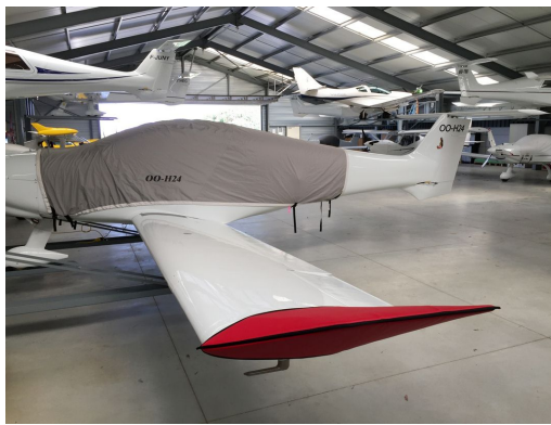
Dynaero MCR.4 Pickup Canopy Cover, Wingtip Pads