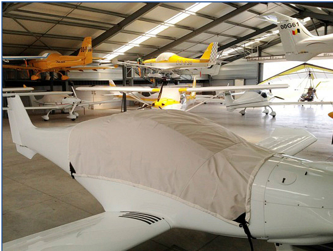
Dynaero MCR Pickup Canopy Cover