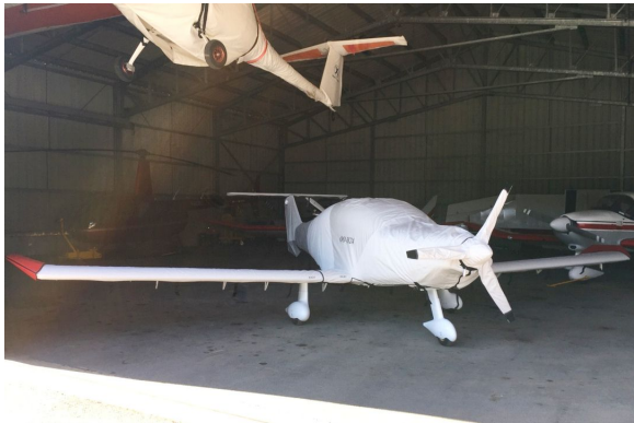
Dynaero MCR.4 Pickup Complete Cover Set.