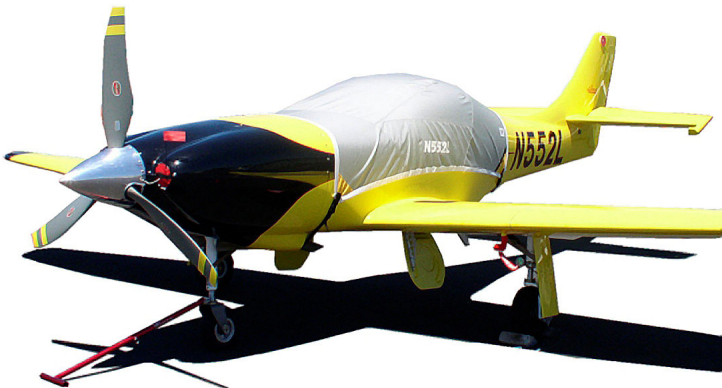
Canopy Cover for Lancair Legacy