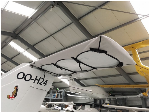
Dynaero MCR Horizontal Stabilizer Cover

WINTER USE MATERIAL - Made with Solution-Dyed Polyester fabric, this option is intended for seasonal use to aid in deicing, rain mitigation, or for occasional travel. The material is lighter and more compact, but more susceptible to UV damage and may have a shorter useful life if used continuously outside than the all-year use material.