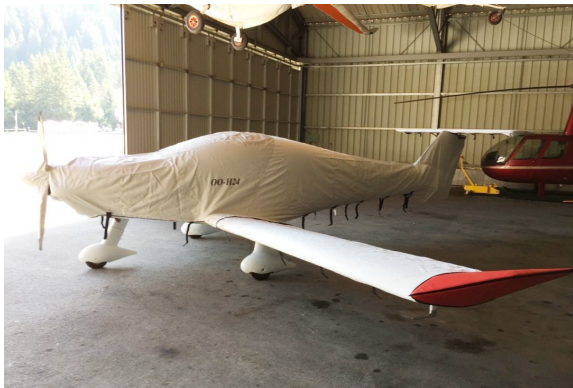
Dynaero MCR.4 Pickup Complete Cover Set.