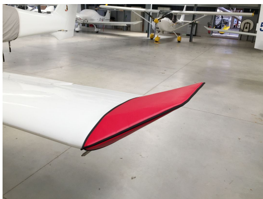
Dynaero MCR Pickup Wingtip Pads

Designed to prevent damage to the aircraft extremities in crowded hangars, these products are made of bright red Naugahyde and thickly padded with a sandwich of closed cell foam. Nowadays they are also made using bright red Neoprene padded laminated (think: wetsuit material).