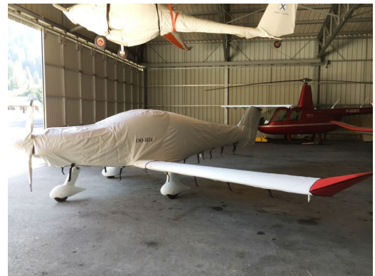
Dynaero MCR.4 Pickup Complete Cover Set.