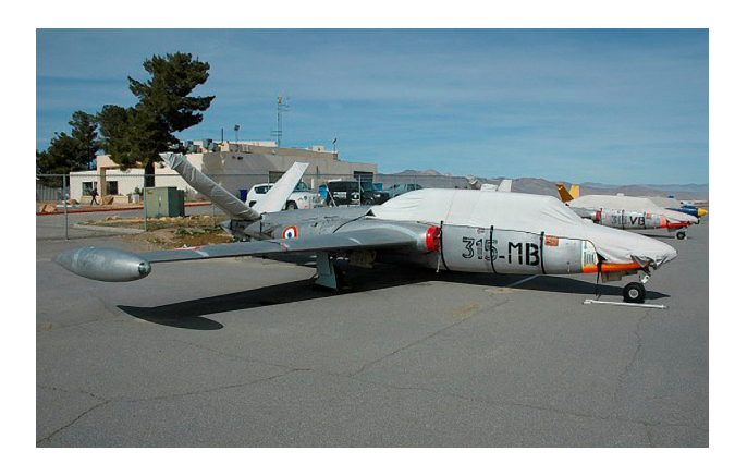
Fouga Magister Canopy/Nose Cover & Tail Stabilizer Covers