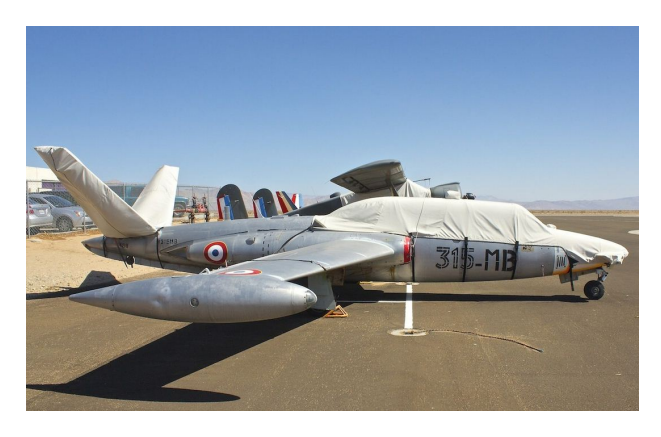
Fouga Magister Canopy/Nose Cover, Tail Stabilizer Covers

WINTER USE MATERIAL - Made with Solution-Dyed Polyester fabric, this option is intended for seasonal use to aid in deicing, rain mitigation, or for occasional travel. The material is lighter and more compact, but more susceptible to UV damage and may have a shorter useful life if used continuously outside than the all-year use material.