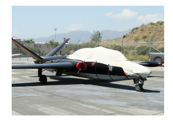
Fouga Magister Canopy/Nose Cover with nose mount loop antenna