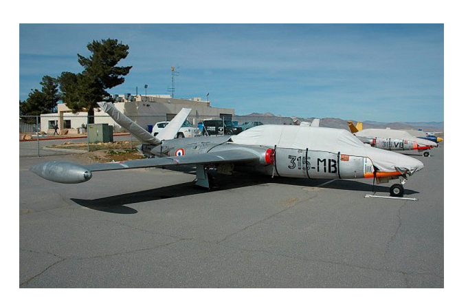
Fouga Magister Canopy/Nose Cover & Tail Stabilizer Covers