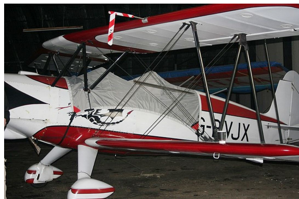
Marquardt Charger MA-5 Light Weight Travel Cockpit Cover