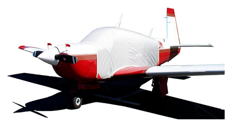
Mooney M20 Extended Canopy Cover & Engine Plugs