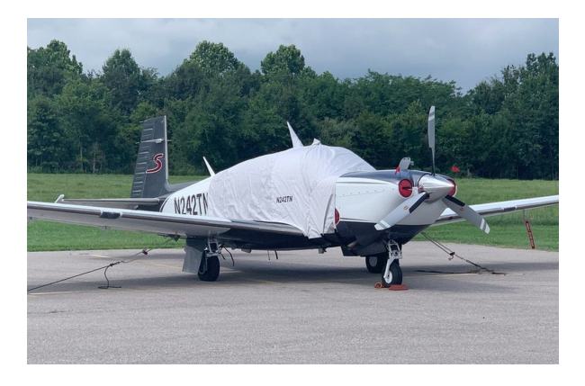
Mooney M20TN Extended Canopy Cover

This cover type is made from Silver Acrylic Sunbrella canvas and is 100% lined with a soft and smooth microfiber. Bruce's Custom Covers developed this material combination especially for aircraft protection. The outer material is medium weight and treated for water resistance, UV resistance and anti-static buildup. The inner lining is a very soft and smooth microfiber to prevent scratching. The material is very reflective, and tests show that the cabin interior temperature can be reduced to near-ambient temperature on the hottest of days. It is water, ice and snow repellent, yet breathable to allow moisture to escape from between the cover and the aircraft surface.