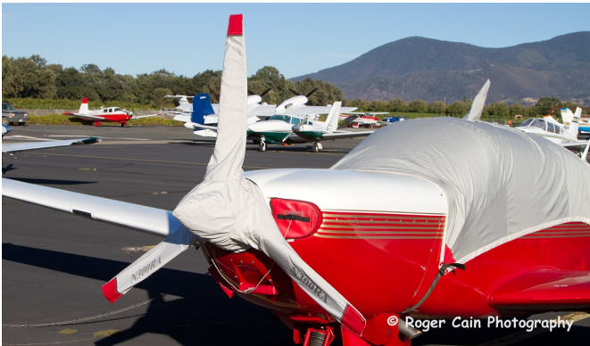
Mooney M20M Bravo 3-Blade Prop Cover, Engine Plugs