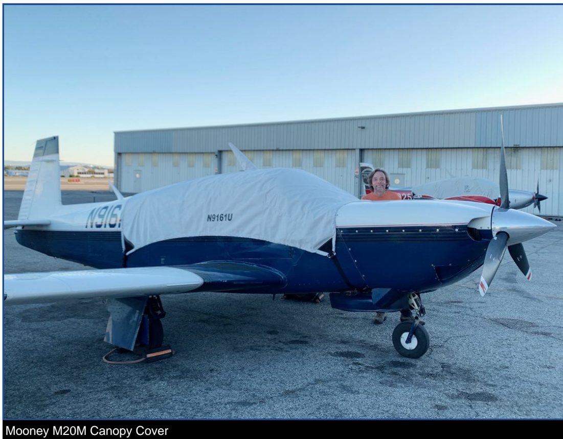
Mooney M20M Canopy Cover