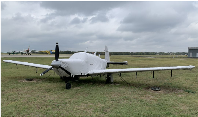
Mooney M20M Bravo Cover Set