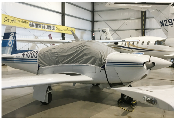
Mooney 201 Travel Cover, Light Weight Travel Canopy Cover, 5 Lbs