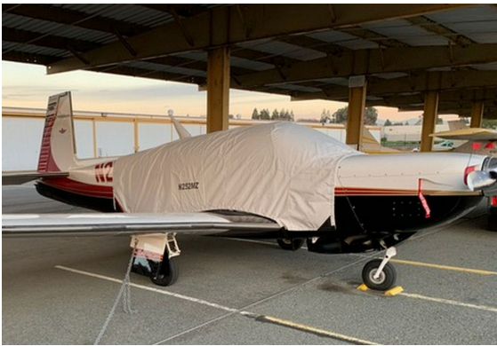
Mooney M20K Extended Canopy Cover

This cover type is made from Silver Acrylic Sunbrella canvas and is 100% lined with a soft and smooth microfiber. Bruce's Custom Covers developed this material combination especially for aircraft protection. The outer material is medium weight and treated for water resistance, UV resistance and anti-static buildup. The inner lining is a very soft and smooth microfiber to prevent scratching. The material is very reflective, and tests show that the cabin interior temperature can be reduced to near-ambient temperature on the hottest of days. It is water, ice and snow repellent, yet breathable to allow moisture to escape from between the cover and the aircraft surface.