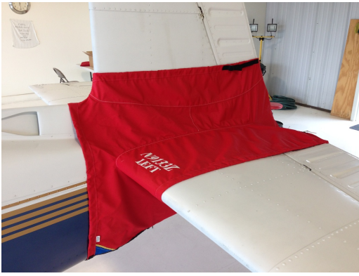
Mooney Tailcone Cover