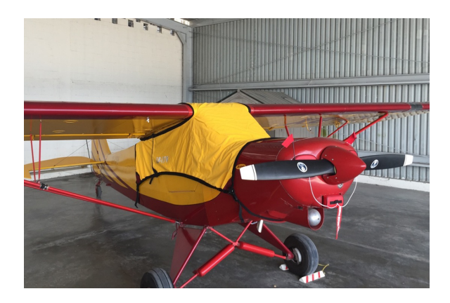
Piper Super Cub Canopy Cover, Engine Plugs