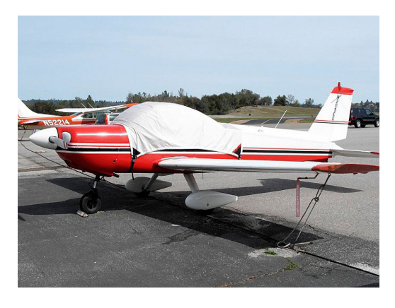
Messerschmitt BO-209 Monsun Canopy Cover