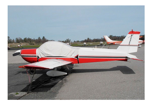
Messerschmitt BO-209 Monsun Canopy Cover