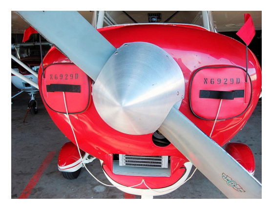
Piper PA-22-150 Engine Inlet Plugs (set of 3)