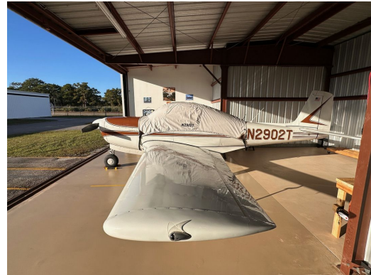
Aero Commander 200D Canopy Cover