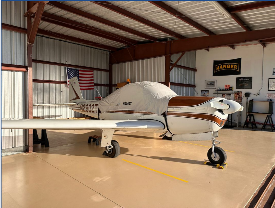
Aero Commander 200D Canopy Cover