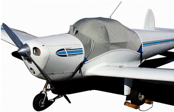
Ercoupe Canopy Cover, bubble windshield model

Travel Covers are made with Silver Solution-Dyed Polyester fabric and only lined over the windshield to save weight. The material is lightweight and more compact for easy stowage in the aircraft. The polyester material is water resistant, but only intended for occasional use outside. We also have an ultra lightweight material available for fitted hangar dust covers. For daily outdoor use, the non-travel Sunbrella Cover is the best choice.