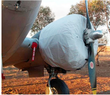
Beech D-18 Engine Covers, Center Section Oil Cooler Inlet Plugs, and Pitot Covers

This cover type is made from Silver Acrylic Sunbrella canvas and is 100% lined with a soft and smooth microfiber. Bruce's Custom Covers developed this material combination especially for aircraft protection. The outer material is medium weight and treated for water resistance, UV resistance and anti-static buildup. The inner lining is a very soft and smooth microfiber to prevent scratching. The material is very reflective, and tests show that the cabin interior temperature can be reduced to near-ambient temperature on the hottest of days. It is water, ice and snow repellent, yet breathable to allow moisture to escape from between the cover and the aircraft surface.