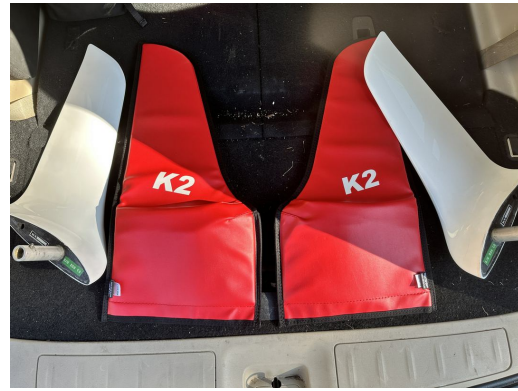
Discus CS Wingtip Pads (Set of 2)